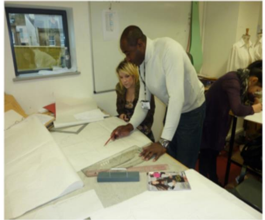
Modelling on the stand and flat pattern cutting in the fashion studio.