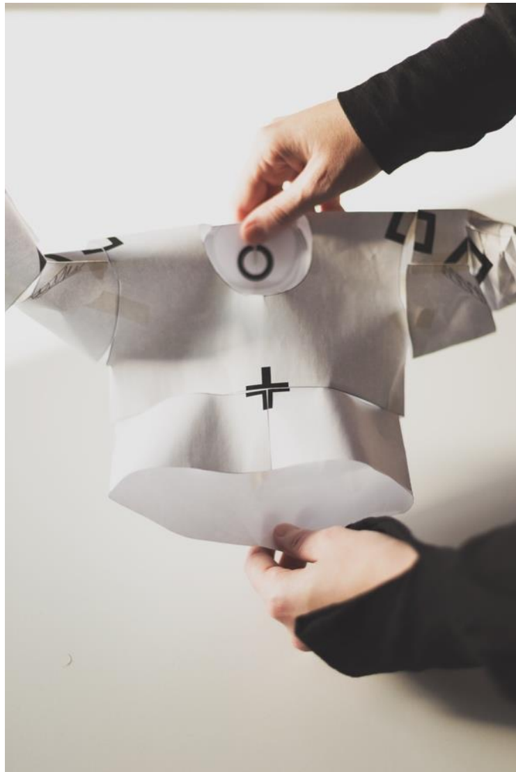
MakeUse: Encoded way finding system for the creation of garment form - Early test using paper prototype.