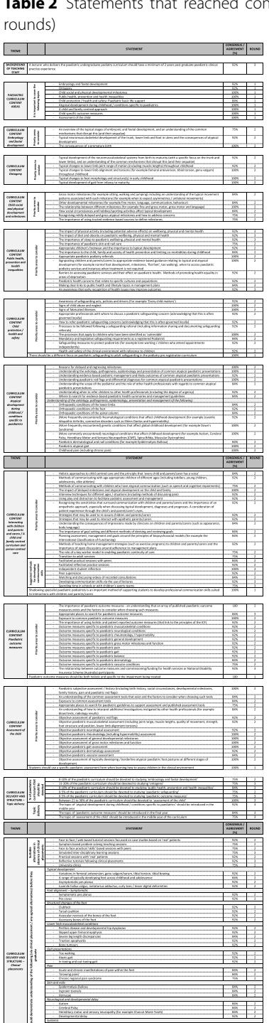
Table 2 Statements that reached consensus or agreement (All rounds)