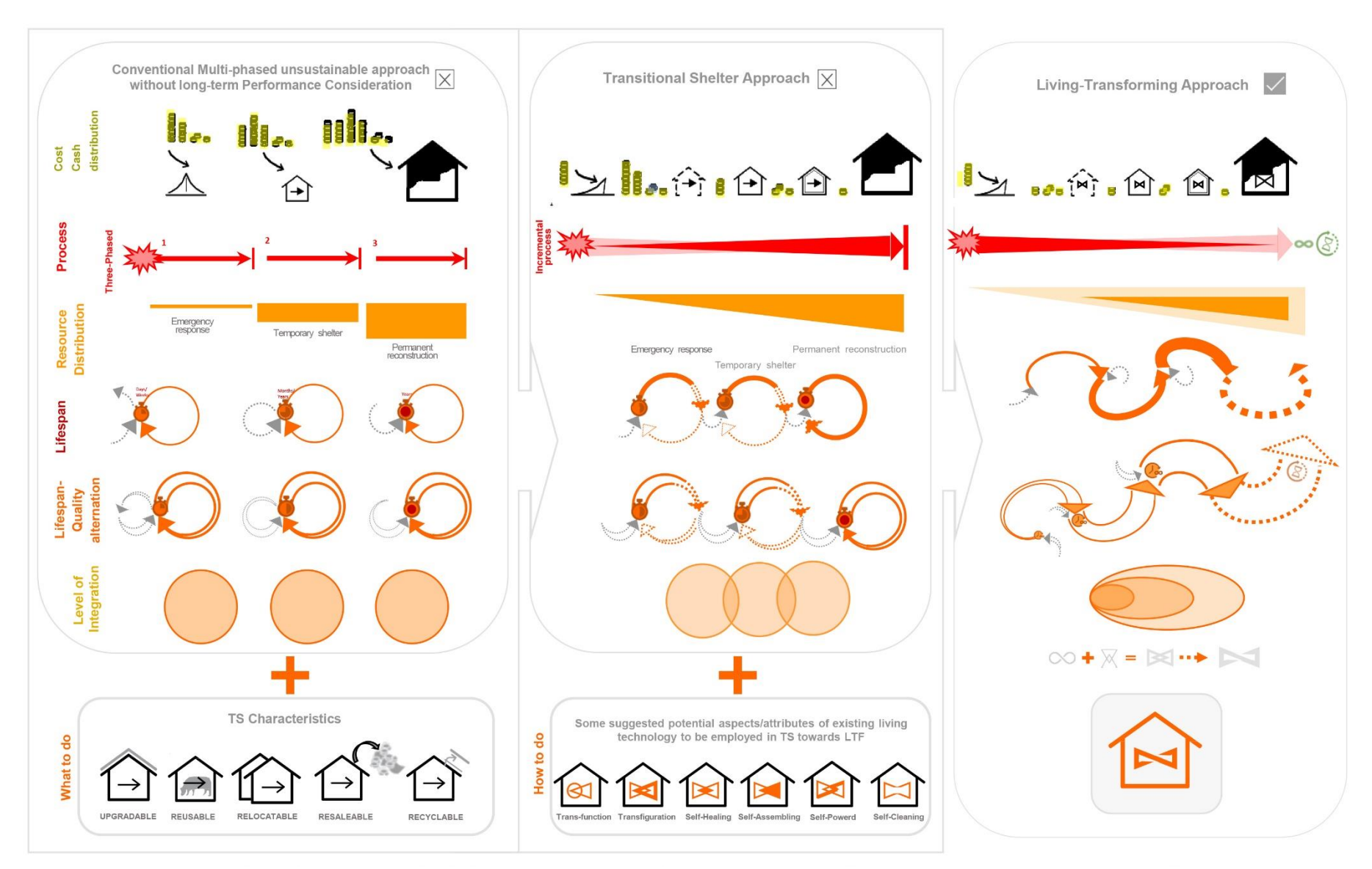
Figure 1 - Comparison of existing shelter provision approaches with in-situ process-oriented LTFDR-shelter concept