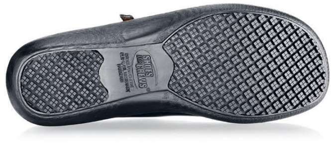
Figure 1 Example of sole of intervention footwear.

Participants were inducted into the trial with a welcome text message followed by a pre-randomisation 'run-in' period of data collection in the form of weekly text messages, for up to 6 weeks, requesting data on slips at work in the previous week. The purpose of the 'run-in' period was twofold: to provide a baseline slip rate; and to assess for engagement with the text message data collection process. By only randomising participants who provided slip data for at least 2 weeks, we hoped to maximise response to the post-randomisation outcome texts. Participants were randomised 1:1 to either be offered and provided with a pair of 5* GRIP-rated slip-resistant shoes or asked to wear their usual work shoes. Randomisation was through the University of York,