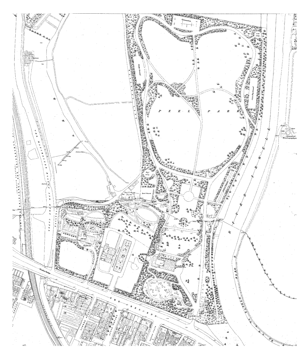
Figure 2. Plan of Peel Park.