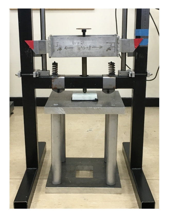
Figure 3, Impact testing jig designed and manufactured by Luca Pagano

Project and Construction Management student : Impact resistance with/without Recyclamine recyclable epoxy coating. The student was tasked to explore the impact resistance of the fused recycled glass and to compare this to other known materials. This project arose at the request of the architect and additionally required the design and fabrication of a test rig as seen in figure 3 below. The research from the student dissertation was subsequently published at the 19<sup>th</sup> International Conference on Advanced Architectural Engineering and Construction Materials, Paris 2017 (Halley, Oseng-Rees, Pagano, & Ferriz-Papi, 2017).