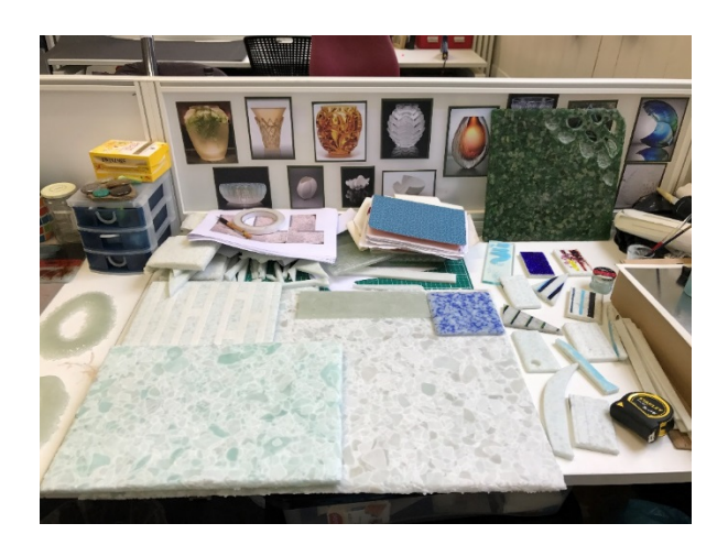
Figure 1, aesthetic exploration of fused recycled glass, by art student

project brief from the external group in terms of texture, colour and reproducibility. Figure 1 below illustrate samples of the exploration of the fused recycled glass.