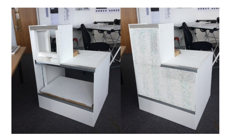
Figure 5, Full size carcass mock-up model made to hold the recycled glass panels,