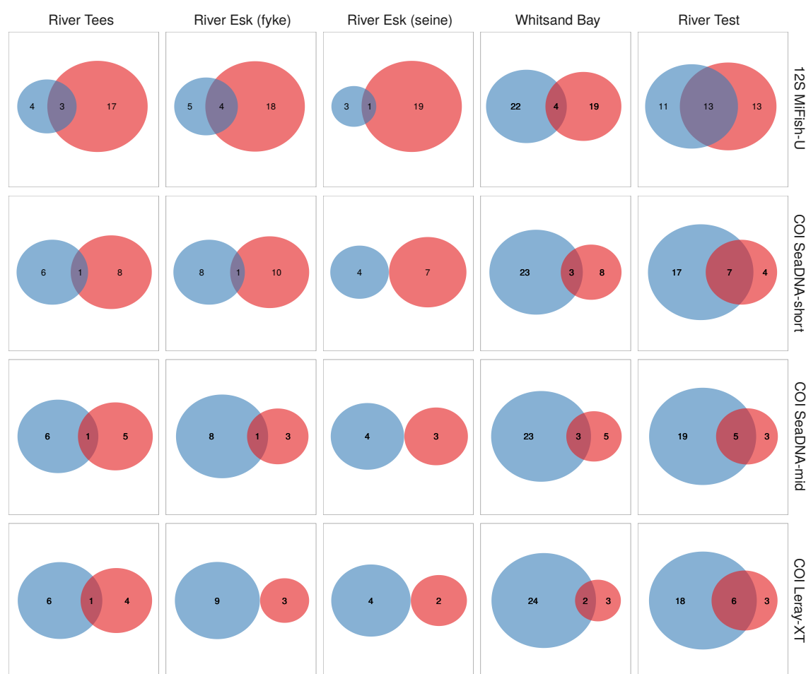
Figure 3. Overlap between fish species found by eDNA metabarcoding (red) and traditional fish surveying (blue). Sizes of circles are proportional only within each primer-location comparison, and not between. Numbers represent number of species in each set. Only marine and estuarine species are shown; freshwater species recorded by the eDNA surveys were removed to allow an equivalent comparison.