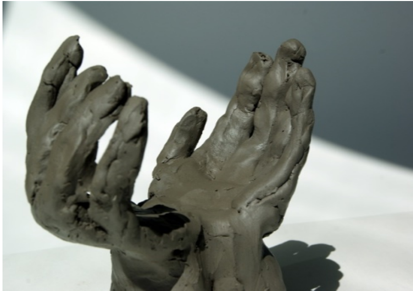
Figure 3 Feeling Uplifted

In contrast to Pierrot, Demi used clay to reveal how she feels when she does have the opportunity to build relationships with the families she is working with (see Figure 3).