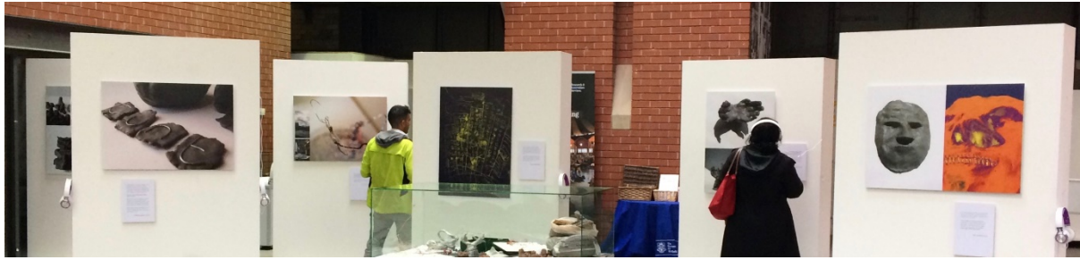
Figure 1: The exhibition