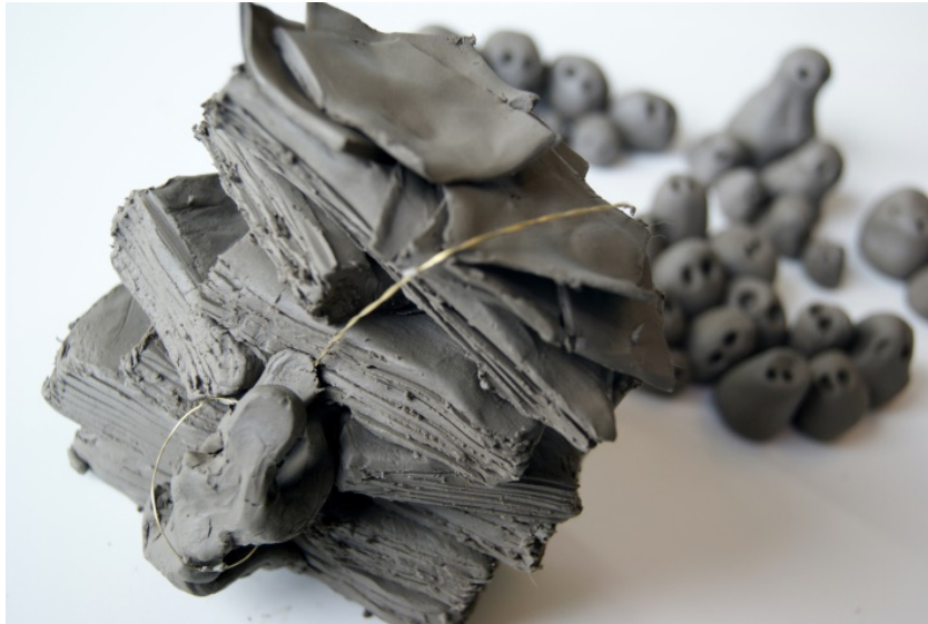
Figure 2 Climbing over the paperwork

This is my everyday life, climbing through paperwork before I can provide support. I need to climb through all this paperwork before I can actually reach my families. When they go, there are more waiting. It's hard to see where they are. I lose perspective of what I'm doing. But it's nothing to do with them as people; it's just about where we are. It's a bigger thing. It's about experiencing cuts and the government not providing enough money. This problem is not just within one office, it's not even in one building, it's not even the council's problem. It's a problem that exists everywhere.