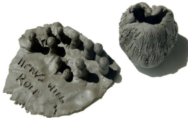
Figure 4 Heads will roll

Five of our participants had strong responses to the formal organisational processes and systems that were in place in their organisation. The post-qualification experience amongst these participants ranged from 6 to 20 years. In some cases, they used their artwork to make connections between the formal processes and the wider context of social work practice. In this next piece of artwork, Frederica used two pieces of clay work to express how these factors affected her (see Figure 4).