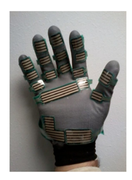
Fig. 1 Position of the sensors on the force sensing glove

Analysis of the Tekscan data was completed using a custom Matlab script (Matlab 2015b, Mathworks, Inc., Natwick, MA, USA). Reaction forces were normalised as a percentage of body weight as previously recommended by [5]. The gloves were calibrated according to the manufacturer instructions. For each transfer, the peak and mean forces above a threshold of 20 N were calculated for both leading and trailing hand. Force values <20 N were