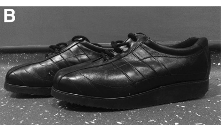
Fig. 1 Unloading shoes (a) and control shoes (b)