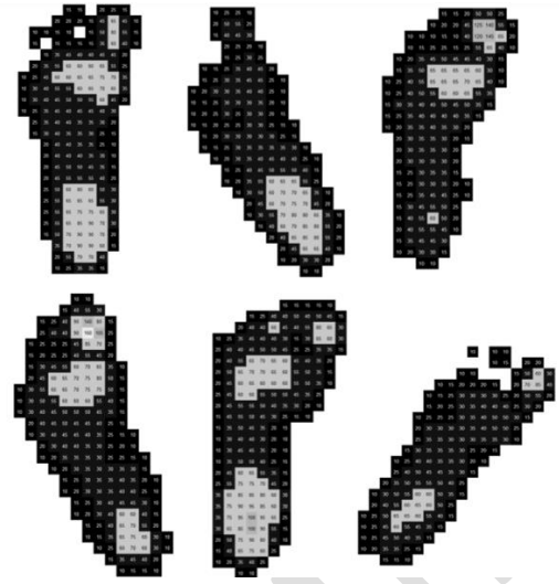
Figure 2. Representative 6 peak pressure steps plantar pressure of the total 24 analysed from infant 2.