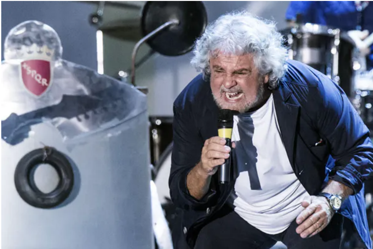
Beppe Grillo is leading calls for a No vote.

To try and reinforce support for the constitutional reform, Renzi has also carried through an electoral reform of the lower house (the Chamber of Deputies), which came into effect in July. This new electoral law (the Italicum ) was expressly designed to reinforce the constitutional reform, which reshapes the Senate, curtailing its powers compared to the Chamber of Deputies – the only house to be directly elected under the new scheme – by ensuring that a stable governing majority would always emerge from the ballot box.