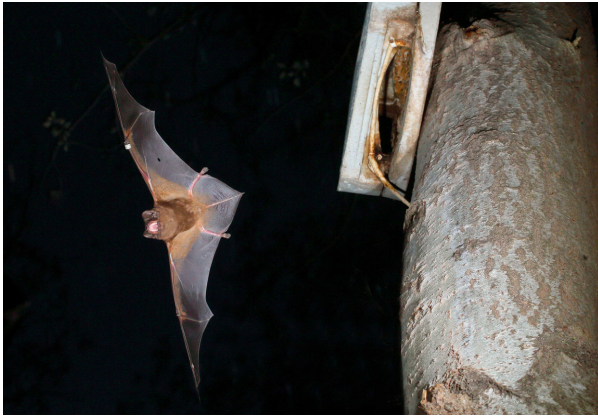
Figure 1. Giant noctule bat, Nyctalus lasiopterus , as it leaves the roost at dusk in the newly forming colony in Doñana National Park.

Park” (MLP) in the city of Seville (37.37° N, 5.59° W). This was the larger of the two colonies, with an estimated 500 bats roosting there in 2007 (Popa-Lisseanu et al. 2008). The other colony occupied a group of palm trees ( Washingtonia sp.) located in the gardens of the zoo of Jerez de la Frontera (ZJF; 36.70° N, 6.15° W); this colony had an estimated population of 100–150 females. In contrast to these seminatural colonies, the fourth population is found in a large natural Mediterranean mixed oak forest in “Los Alcornocales Natural Park” (ANP) around 100–150 km southeast of Seville (36.31° N, 5.44° W) and has an estimated size of several thousand individuals that were sampled at different localities.