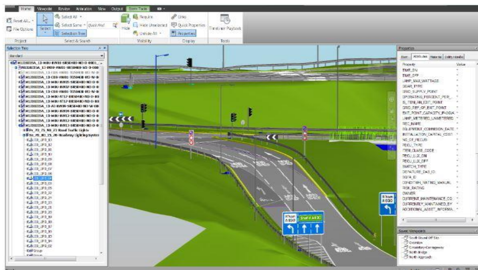
Figure 2: Screenshot of the M1J33 BIM Model (Mouchel Consulting,2015)

January – April 2014. The project team worked with the management team and supply chain through collaborative monthly workshops, to develop the model which contains detailed design and contractual information, existing management asset data, pavement data, as-built information and the contents of the Health and Safety File. Good collaborative relationships were maintained throughout the development and construction phases of the project between all parties. This led on to a smooth handover of the scheme into maintenance, due in part to the development of the BIM model. The model is now being used as an asset maintenance tool for the first time in the country. Important lessons learned include; (i) current HE databases are very high level and do not capture the granularity of data available, as required by the maintainers, (ii) further work is needed to capture all stakeholder requirements, so that a comprehensive recording system can be developed, which will enable maintainers and stakeholders to better interrogate and use captured data.