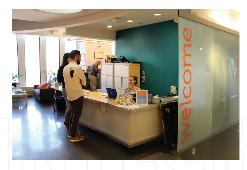
Figure 13. Concierge in the Kendall Square CIC building.

Besides the urban pattern encouraging knowledge and innovation building, Kendall Square also includes key-hotspots for informal decision making and cross-clustering, such as the Cambridge Innovation Centre, CIC [53]. The CIC is not an incubator neither an accelerator, it is a private entrepreneurial activity based on renting shared and flexible office spaces designed with an innovative rationale. It currently hosts over 700 companies across two buildings, located in Kendall Square and in downtown Boston, about 500 of which are start-ups. The