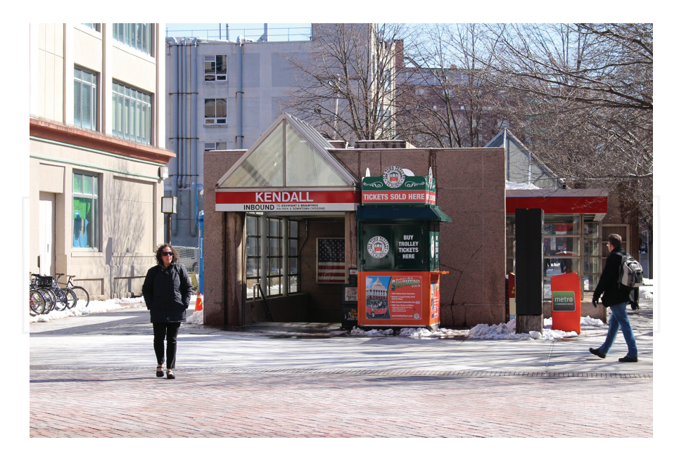
Figure 11. Transit station, bicycles, pedestrians: a walkable environment.