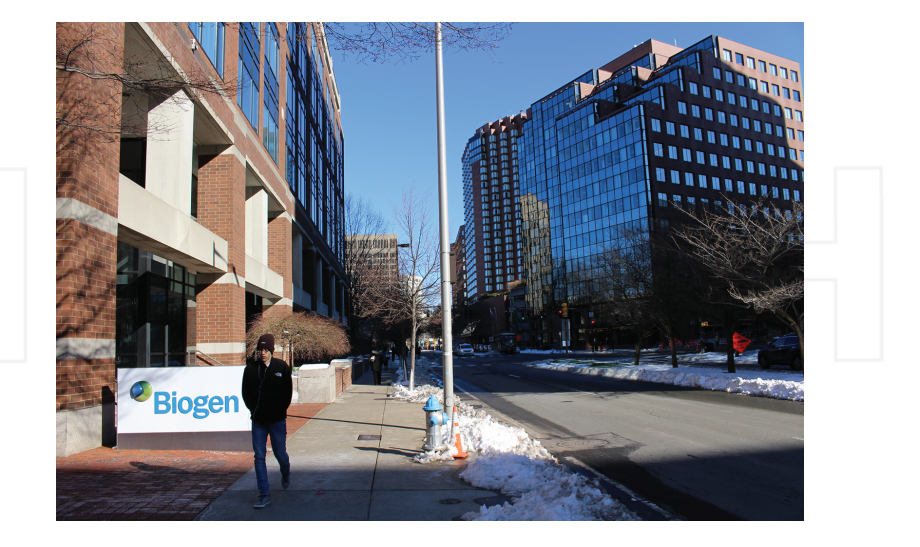
Figure 5. Companies located in the Kendall's immediate surroundings: Biogen.

Private companies perceive the economic benefit of being localised in an innovative district, and are willing to pay the extra costs associated with a more expensive location in order to get extra benefits in return, including the well-being (and related increase of productivity) of their employees and the opportunity to benefit from the powerful network of informal and multi-disciplinary connections, made possible by the specific features of the urban fabric (Figures 3–12).