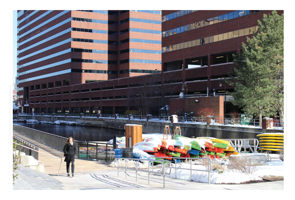
Figure 7. Amenities in the Kendall's immediate surroundings (author's picture).