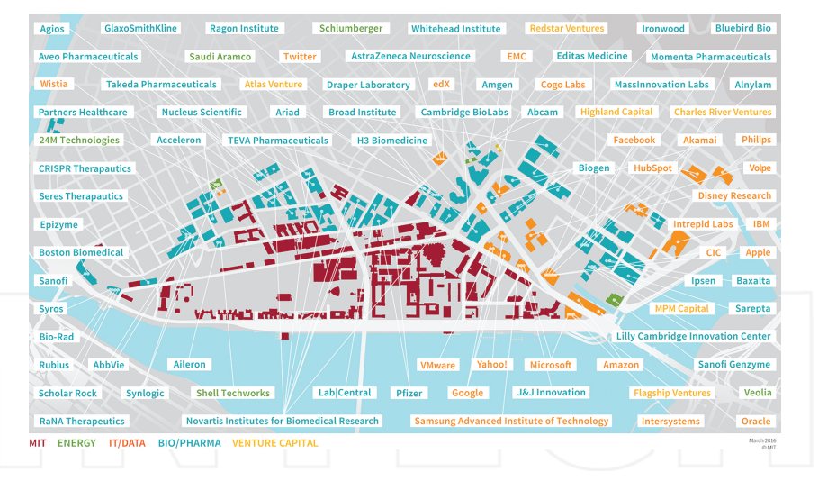
Figure 1. MIT innovation cluster, March 2016.

What is the rationale that creates value out of the proximity? Recent studies focus on the creation of successful groups of players capable of activating cooperation on the basis of the mutual trust [39]. Building on this concept, an extensive literature is blossoming in support of mutual trust and cooperation as triggers for successful social dynamics (for example [40]). What cluster potentially does is that it increases the roles of reputations by increasing the frequency of interaction and also how observable actions are. Therefore, innovative urban spaces, in order to be supportive for a specific kind of entrepreneurs, those who are willing to cooperate in producing shared knowledge, has to support density, accessibility, and also shared spaces that make good and cooperative actions frequent and observable [41].