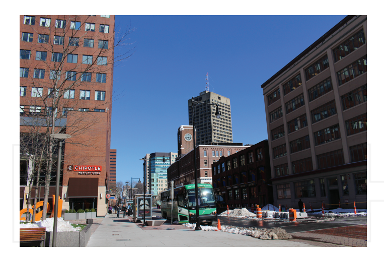
Figure 12. Large sidewalks, benches, bus stops: a pedestrian friendly place.