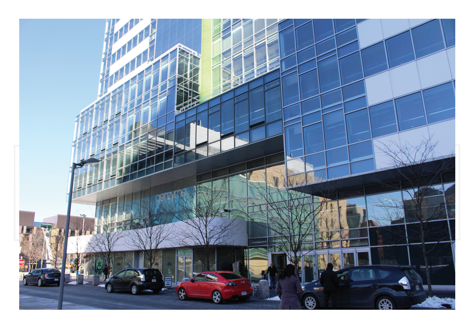
Figure 8. Companies located in the Kendall's immediate surroundings: Genzine.