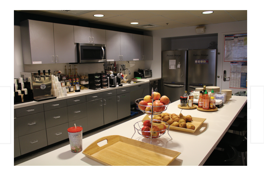
Figure 15. Complimentary shared spaces.