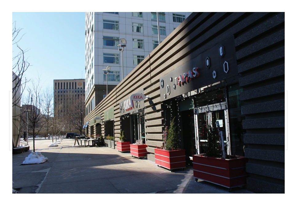
Figure 6. Restaurants, coffee shops, in the Kendall's surrounding.