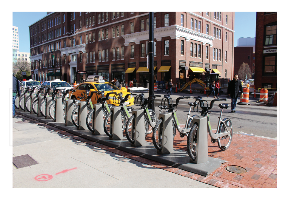
Figure 10. Bike sharing facilities in Kendall.