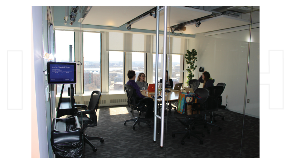
Figure 14. Complimentary meeting rooms in the Kendall Square CIC building.