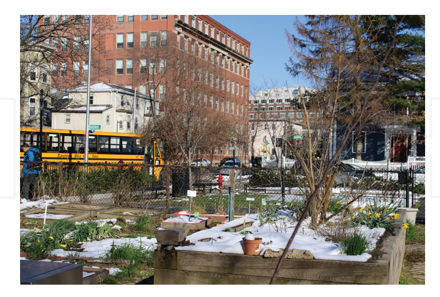
Figure 3. Open spaces and public services around the Kendall Square area.