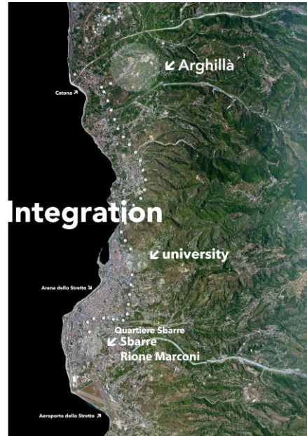
Fig. 1. Case studies localization, map elaborated by A. Errigo, G. Minervino, Y. Ou, L. Starace (2016)