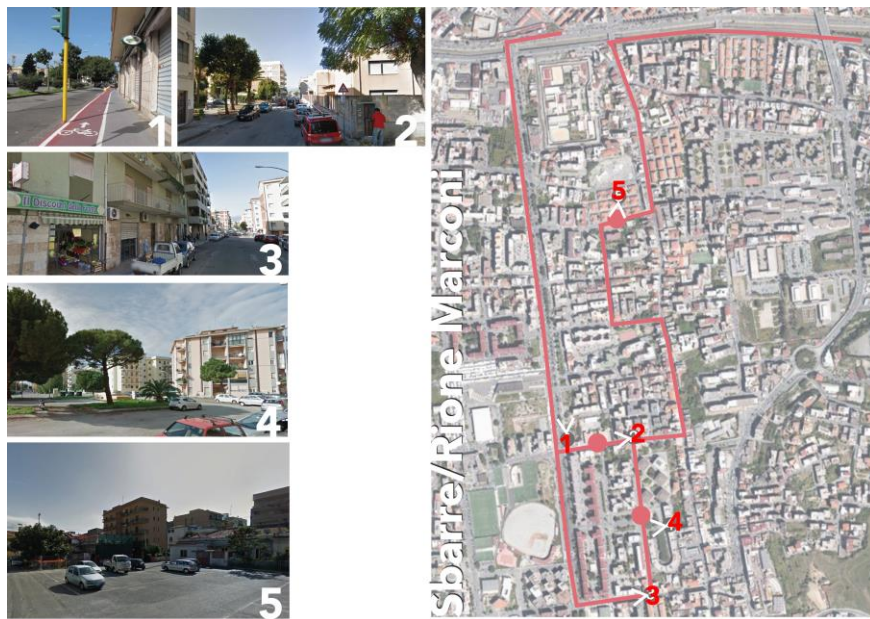
Fig. 3. Visual survey of Rione Marconi-Sbarre (elaborated by Errigo, Minervino, Ou, Starace 2016)