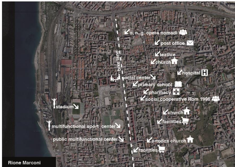
Fig. 4. Survey of the public facilities of Rione Marconi-Sbarre (elaborated by Errigo, Minervino, Ou, Starace 2016)