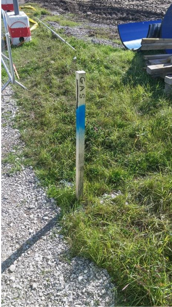
Fig 6. Marking underground utilities by using improvisational visualisation practices