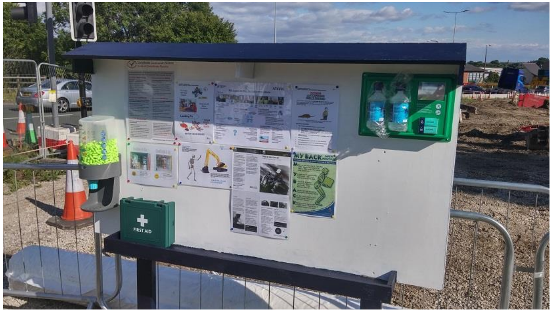
Fig 7. On-site health and safety boards