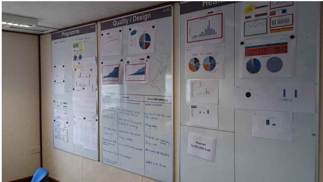
Fig 1. Meeting room ( obeya ) at Case 1