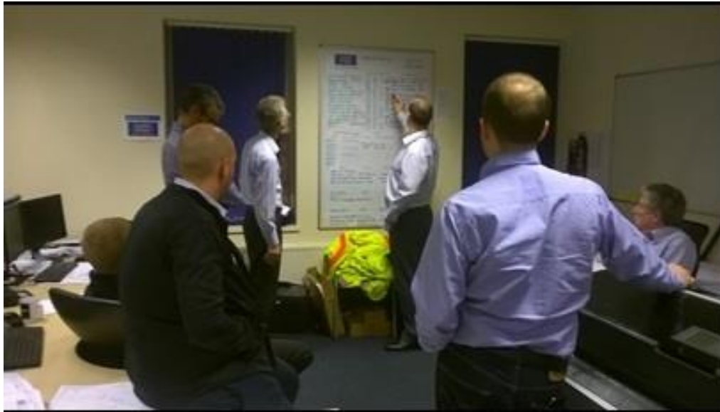
Fig 2. Design team's visual performance board at Case 2