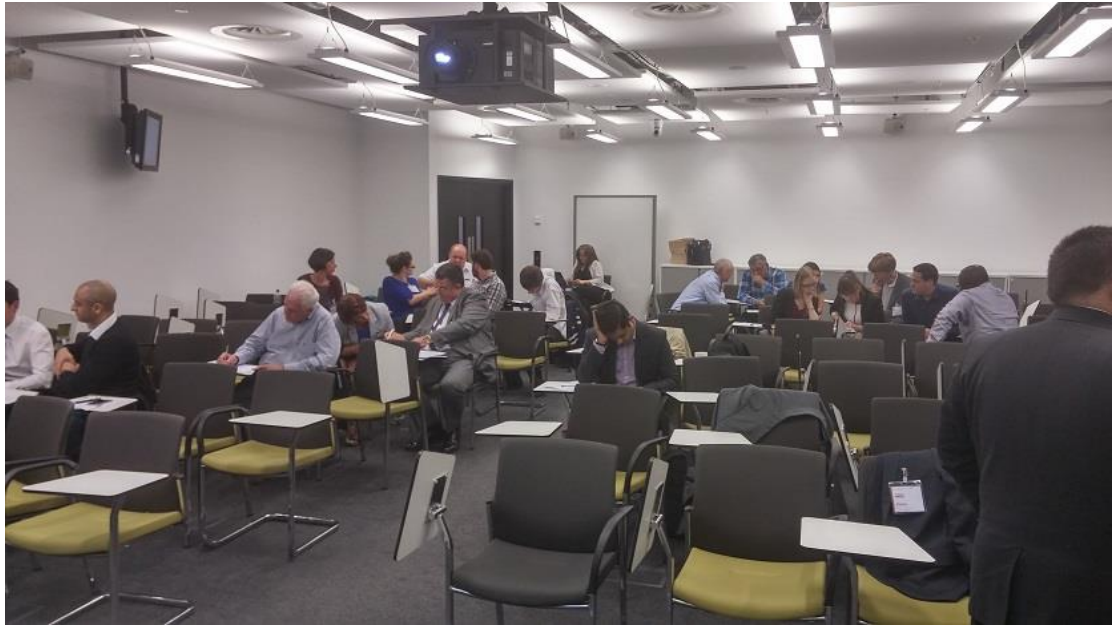
Fig 8. Visual Management focus groups