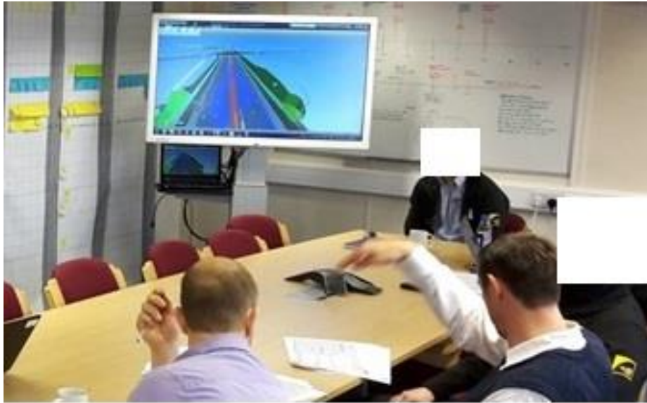
Fig 4. Use of BIM models in Collaborative Planning meetings at Case 4