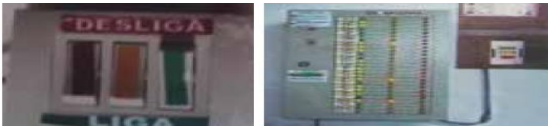
Figure 2: Example of Analysed Case (No. 86) (after Tezel et al., 2010)