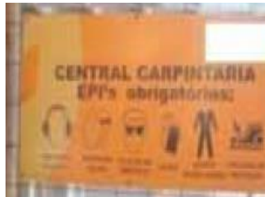
Figure 3: Example of Analysed Case (No. 157) (after Tezel et al., 2010)