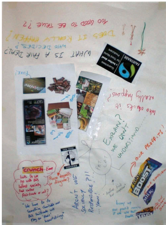
Figure 2 Collage 2.