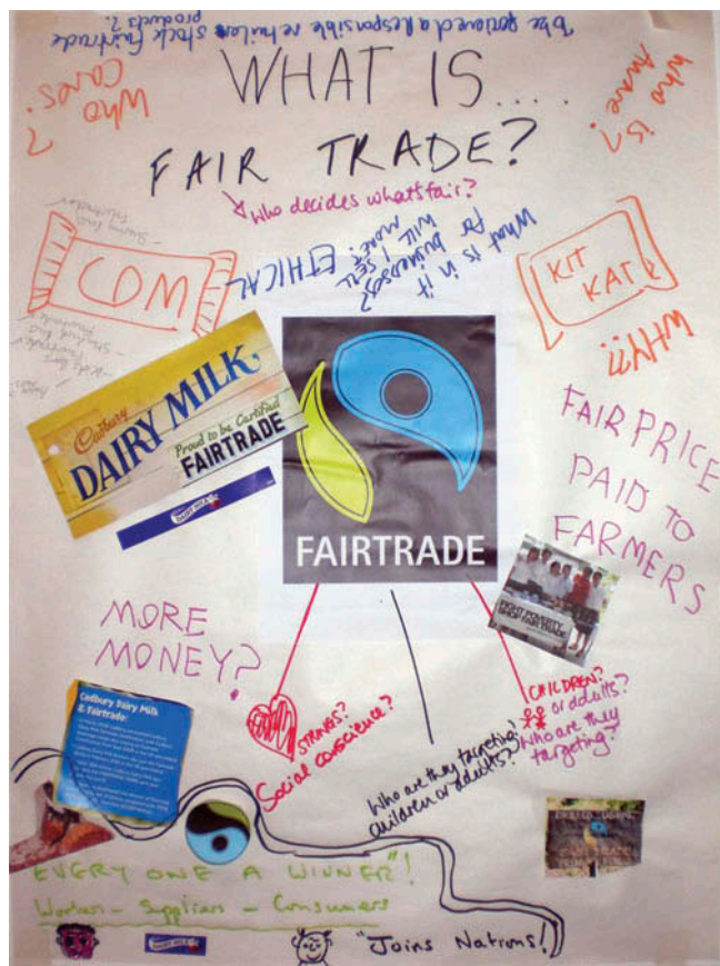
Figure 1 Collage 1.