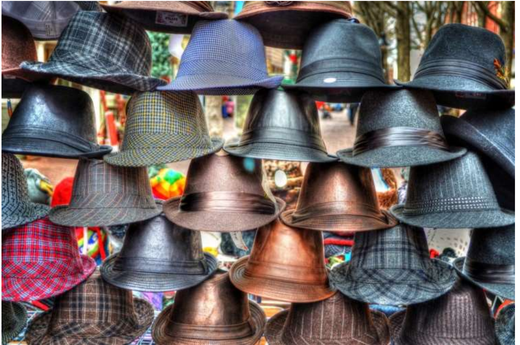
BobMcal: Attribution 2.0 Generic (CC BY 2.0)