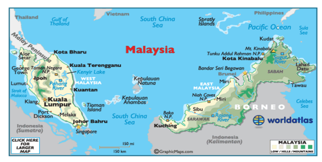
Figure 1.2 Peninsular Malaysia and East Malaysia (Sabah and Sarawak)

Sarawak is the largest of Malaysia's thirteen states with a population of over 2.4 million (Department of Statistics 2010). Sarawak presently has eleven divisions namely Kuching (the capital city), Samarahan, Sri Aman, Betong, Sarikei, Mukah, Sibu, Bintulu, Kapit, Miri and Limbang. It is directly joined to the State of Sabah to the northeast where the Sultanate of Brunei forms a double enclave. Inland, Sarawak borders with Kalimantan, Indonesia. Sarawak is truly a multicultural state with 27 ethnic groups practising a variety of religions including Islam, Christianity, Buddhism, Taoism, and Confucianism, ancestral worship, Baha'ism and Animism.