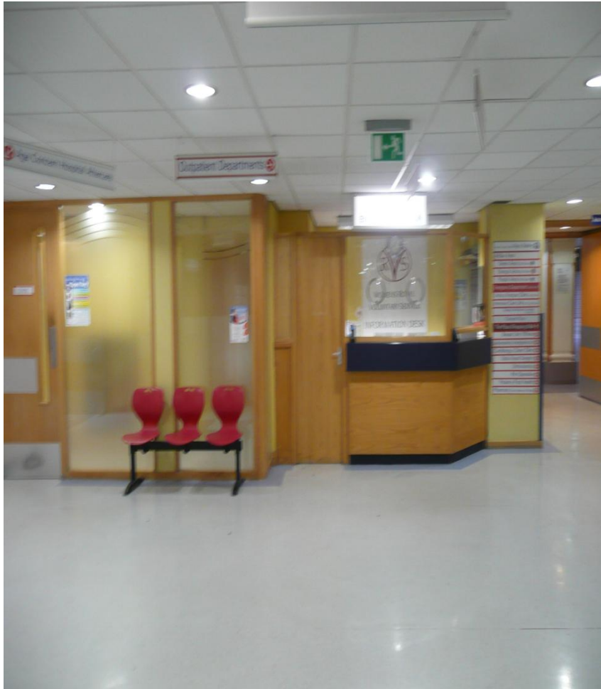
Entry to route 1