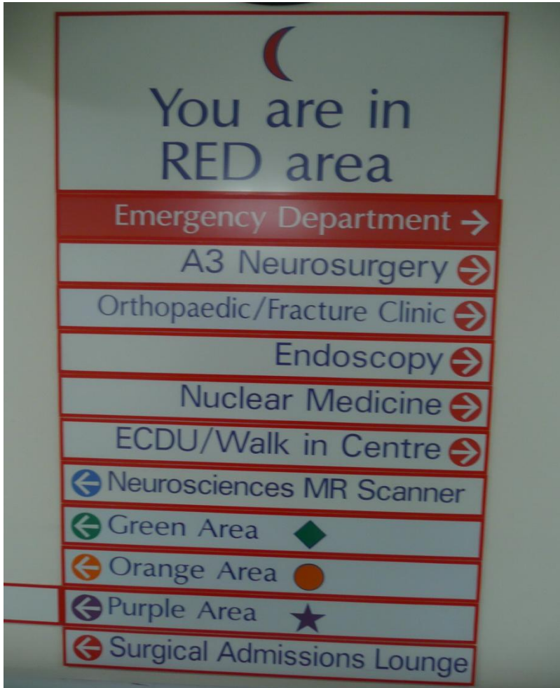
Entry to route 2