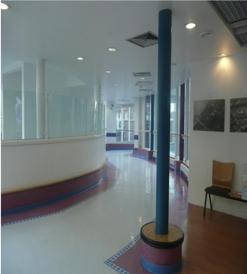
Signs seen further down the corridor