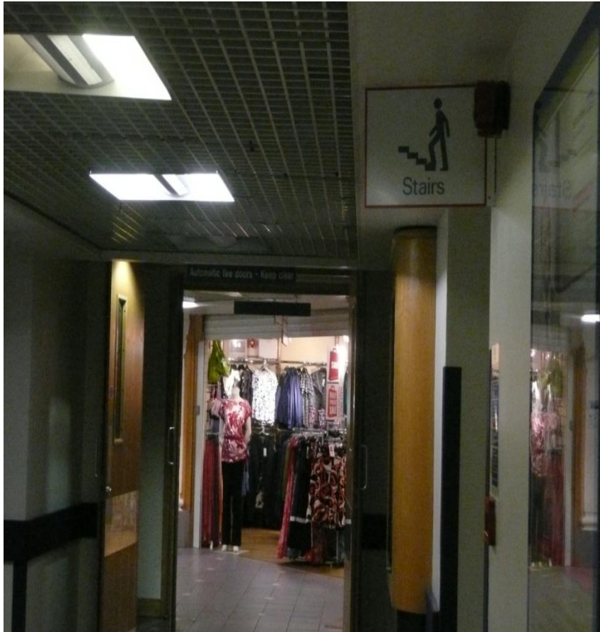
Plaza Shopping Mall 3