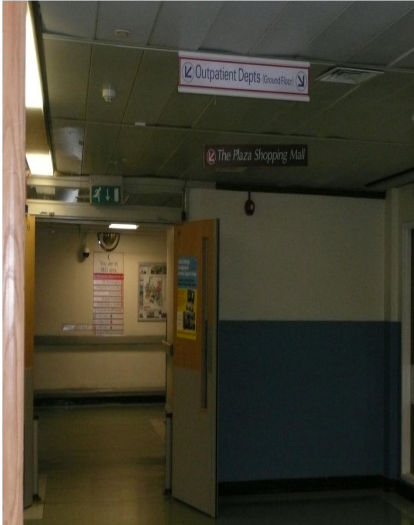
Exit point for route 1