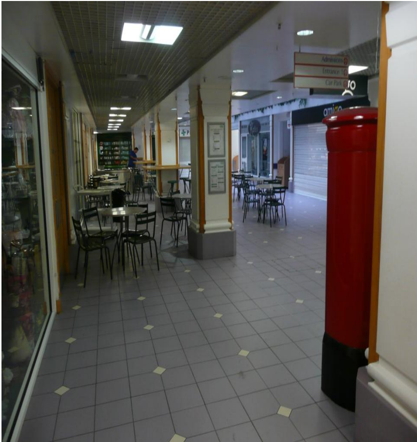
Plaza Shopping Mall 1