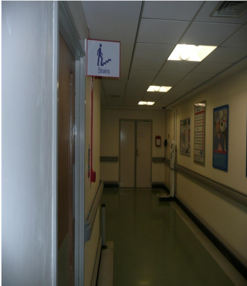
Exit for route 3