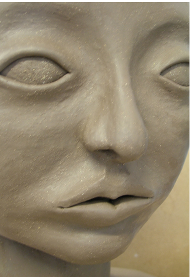
Above: MA Research- Questions that unbalance me: Exploring Sikh womanhood through Sculpture. Crank clay. Work in progress. 2012

MA Research: www.sabbicreate.wordpress.com