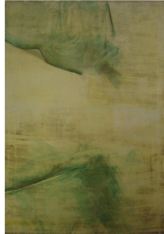
Patricia Farrell Untitled 2008 mixed media 81 x 123cms

the work in my thesis with a view to subsequent publication in forms that involve independent research and collaboration with other art and philosophy practitioners.