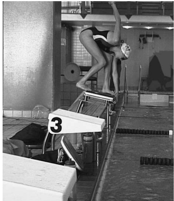
Figure 1 — The one-handed track start.

A portable multicomponent Kistler force plate with built-in charge amplifier (9286AA, Amherst, New York) sampling 500 Hz (600 mm \times 400 mm \times 35 mm) measured the ground reaction forces. The force plate was