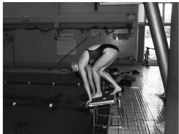
Figure 2 — The track start.

mounted to a 10-mm-thick aluminum plate that was bolted to the starting block frame, and the force plate feet were affixed to the aluminum plate. An aluminum T-bar handrail instrumented with a load cell (Biometrics, UK) was affixed to the front of the starting block to measure the force application of the upper limbs (Cavanagh et al., 1975). The load cell was mounted inferiorly to the center of the T-bar handrail to minimize force measurement error during the one-handed track start (Figure 3). The modifications made to starting block did not significantly alter its height, width, or