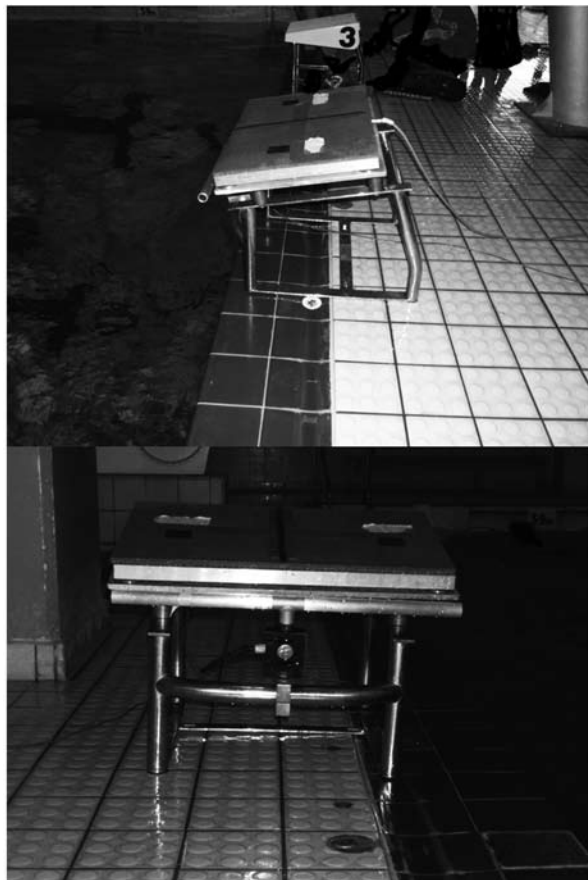
Figure 3 — The modified starting block.

angle. However, due to the dimensions of the force plate, the depth of the starting block was reduced by 7 cm. Force data were analyzed using Bioware version 3.24 (Amherst, New York) and upper limb data were analyzed using Biometrics Datalogger (Biometrics, UK) software.