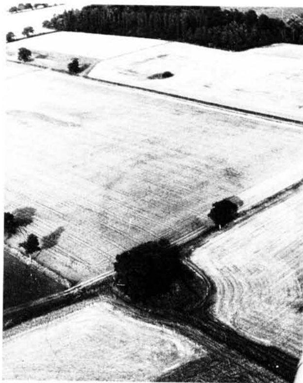
Fig 2.5: Leigh Oaks II, a circular enclosure on clay which has produced 2nd century AD pottery.

The archaeological evidence for settlement during the first millennium BC and early first millennium AD (Iron Age and Romano-British era) is dominated by two types of evidence; earthwork enclosures and cropmark enclosures. The best known of these are the earthwork