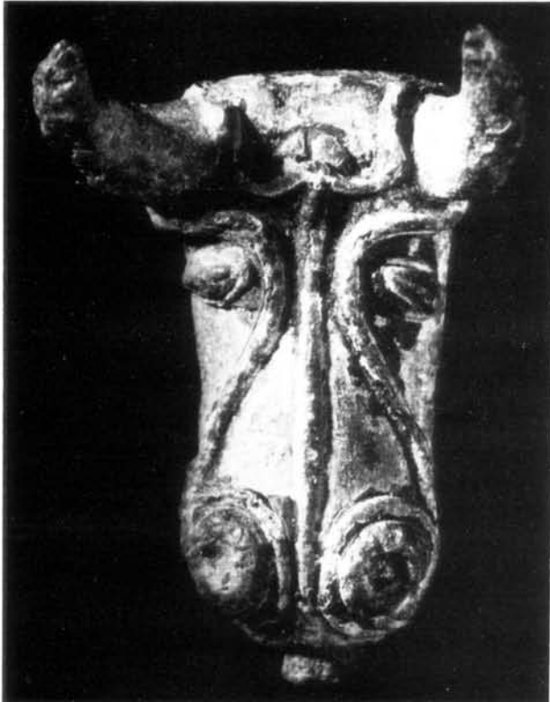
Fig 2.1: Iron Age bull's head escutcheon, a recent metal-detector find from near Crewe, Cheshire. Scale 1:2.

In the last 15 years rural settlement sites and material culture of the late prehistoric and Romano-British era have started to emerge west of the Pennines and south of the Lake District. The range of material that has come to light is varied and in some cases spectacular. From pottery and farmsteads (Fig 2.2), to gold coins, sculpture (Fig 2.1) and bog bodies our perceptions of the period in this area are starting to change. However, we have been, and still are, hampered by our own prejudices; in the assumption that the North West is an archaeologically backward area; by the perceived difficulties of recovering the evidence itself; and by the interpretations we have put upon the evidence. J D Marshall writing in the Lancashire volume of the City and County Histories series in 1974 noted that 'Lancashire as a whole was thinly settled in pre-history, and the region was plainly inhospitable' (Marshall 1974, 13). This opinion was echoed later by