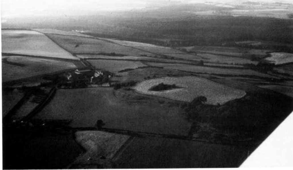
Fig 2.3: Eddisbury hillfort looking north, showing the surviving earthworks. This site was abandoned sometime in the late first millennium BC.

evidence, overwhelmingly from mossland deposits, but also including samples from archaeological contexts, can be used to reconstruct the environmental history of the period. Of the main mossland and lake deposits studied within the Mersey Basin (Cowell & Innes 1994; Hall et al 1995; Leah et al 1997) there are only seven dated pollen cores that having a bearing on this period from the lowland areas of the Basin; two from Chat Moss, two from Lindow Moss, one from Holcroft Moss, one from Knowsley Park Moss and one from Simonswood Moss. Although seven detailed pollen cores have been published from the upland regions fringing the study area to the north and east (three from the southern Pennines and four from the Rossendale uplands) only three, one from Rossendale at Deep Clough and two from the southern Pennines, at Rishworth Moor and Featherbed Moss, impinge on the Mersey Basin. These diagrams provide regional environmental data concerning two key areas within the Mersey Basin. Firstly, the lower Mersey terraces around Warrington. Secondly, the 110m-250m AOD zone which, it has been argued, was marginal arable land throughout the first millennium BC.