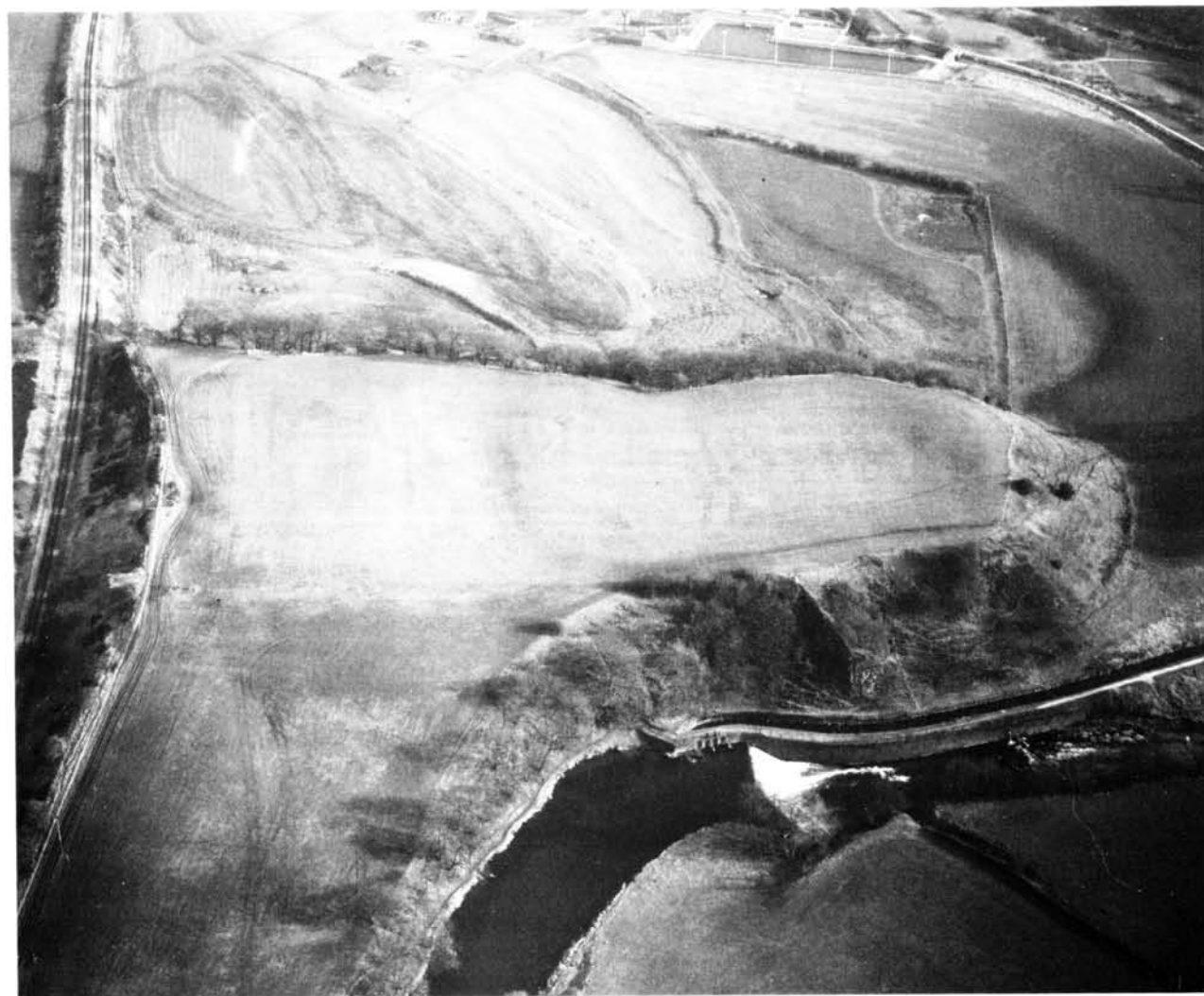
Fig 2.4: Castlesteads promontory enclosure in the Irwell valley to the north of Bury. An escarpment edge site from the late Iron Age. Note the single ditch cutting off the promontory in the centre of the photograph.

A brief period of forest regeneration was followed by the second phase of woodland clearance within the Mersey Basin, during the late first millennium BC. This was characterised by a period of highly intensive agricultural activity, involving major deforestation, high levels of weed pollen, and, for the first time, the introduction of cereals (and possibly hemp/hops) in high quantity. This period of intense land use has only been dated at Lindow Moss II (SJ 8200 8050), where this major clearance episode occurs after 430-250 BC ( 340 \pm 90 BC; BM 2401). During this phase tree and shrub pollen fell to 74%, herbaceous pollen rose to 23% and cereal pollen accounted for 3% of the dry land pollen total. Significant increases in the relative frequency of gramineae, Plantago Lanceolata , and Rumex pollen, coupled with wheat pollen and possibly barley oats suggested to Oldfield that this phase, around