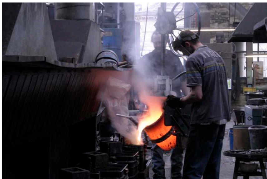
Pouring molten gun metal into the green sand moulds

project is designed to help local schools, third sector organisations and individuals to run additional activities that engage young people to develop skills and interests that can promote opportunities and choices for direct action. The long term goal of the project is to roll out the similar initiatives to all districts of the region, specifically those where violent and weapons based crime represent a serious issue for communities engaged in the project.