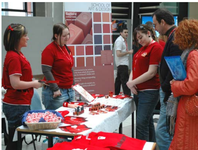
Year 11 pupils presenting REdGENERATION products at an International Conference

Discourses, Power and Resistance in 2007. For the researchers and artists involved, the achievements of the young people in the project excited the possibility for the application of similar processes in comparable contexts. Current funding from the UK Arts and Humanities Research Council is enabling the team to test and refine a model or method of practice for transfer to public and third sector partners.