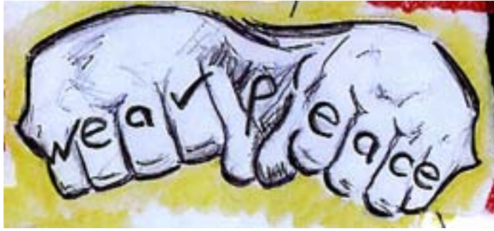
Jewellery concept design, Manchester College. 2010