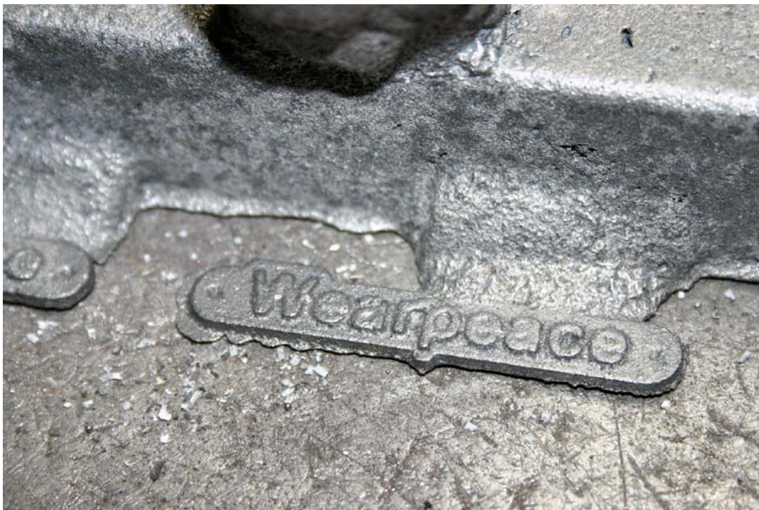
'Wearpeace' is one of the brand messages devised through the 'Guns to Goods' initiatives with CARISMA. The 'Wearpeace' logo badge is made entirely from gun metal taken from gun amnesties.

"Guns into Goods" therefore aims to harness and develop a campaign culture, with affected communities in the North West of England, aiming to remove firearms and replica guns from circulation and reduce the incidence of gun-related crime.