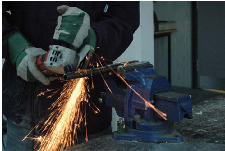
Grinding hand held firearms for decommissioning, to prepare for transfer to the foundry.