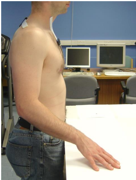
Figure 1: Measurement setup during the ironing task. Subjects had to alternately touch two dots on a solid horizontal in front of them. Two linear arrays of eight electrodes were placed on the sternocleidomastoid muscle and the trapezius muscle of the dominant side.