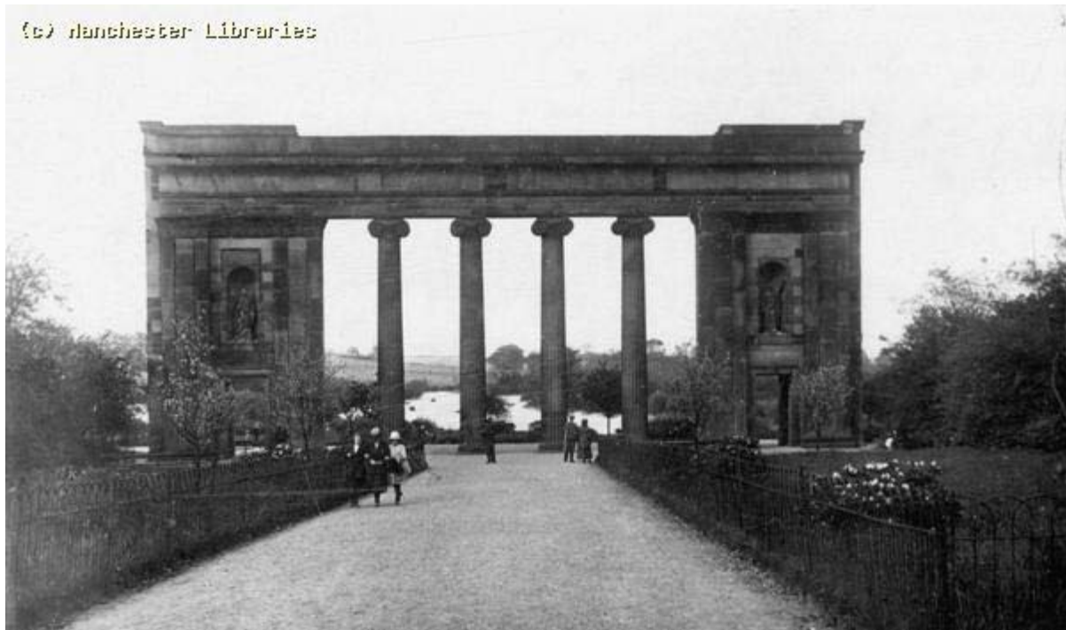
Figure 3 – The old Town Hall colonnade near the lake, Heaton Park 1913