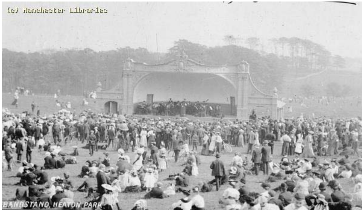
Figure 1 – Crowds near the Heaton Park bandstand, 1906