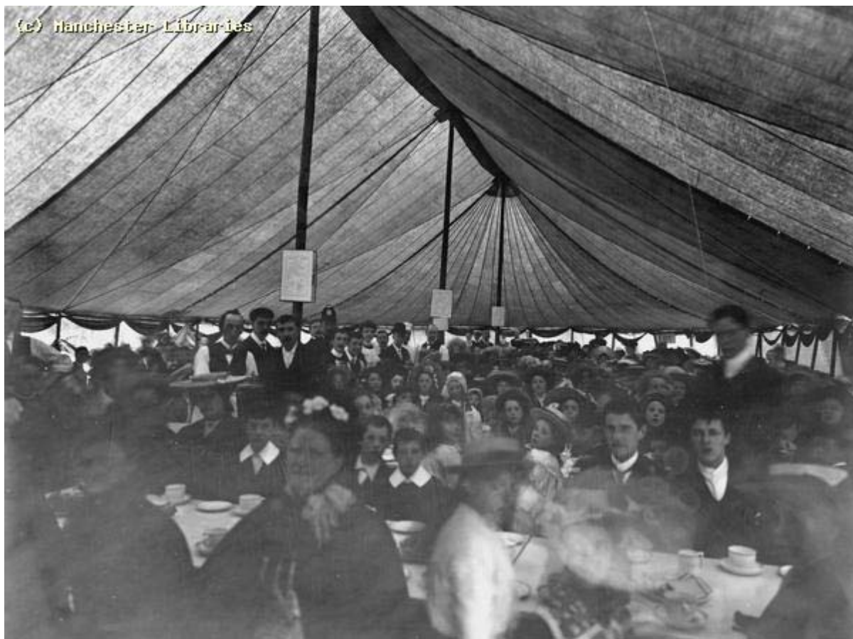
Figure 2 – Crowds in the refreshment tent at Heaton Park, 1906