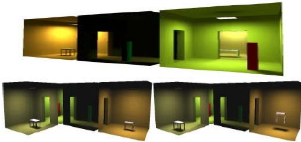
Figure 2: Examples of a rendered scene and object motion in the lighting Simulation

The lighting application will enable the user to look at different ways of lighting the spaces by clicking and dragging objects into spaces and placing them at different locations within the space. The reflections and contrasts from surfaces of furniture, walls, windows, etc can be viewed, enabling the user to place lights in their optimal positions for best lighting in the room. Some example layouts are provided for the client or user to see how different positions affect the light in the space. Furthermore, the effect of natural daylight on the spaces can be viewed in the simulation. Figure 2 shows some lighting simulation analysis from different perspectives.