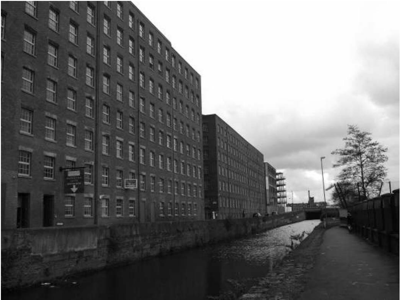
Figure 2. Murray's mill of 1798 on the Rochdale canal in Ancoats.

of both the 18th and 19th centuries that we will then be able to assess fully the Manchester region's context within the national development of industrialisation.