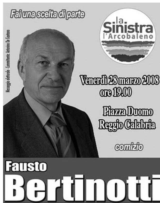
Figure 2: 2008 election campaign poster featuring SA leader, Fausto Bertinotti