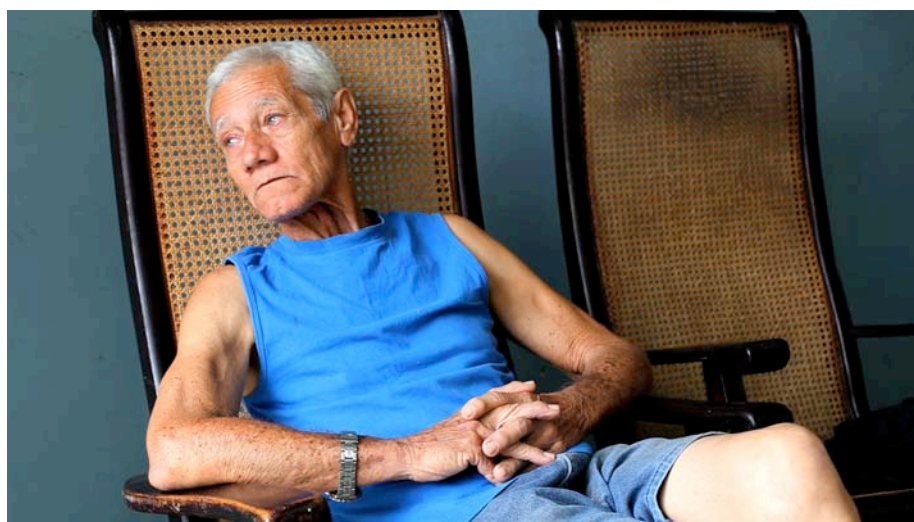
Figure 1: Vainilla Chip (2009).

In my own work, I try to work on developing these transcendental qualities to my approach and form. One example is the documentary, Vainilla Chip (Knudsen, 2009), 7 and the forthcoming feature film, The Silent Accomplice (Knudsen, 2010).