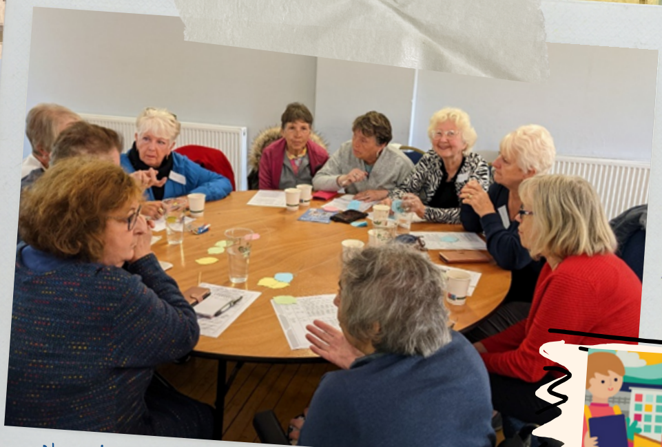
What does change look like?