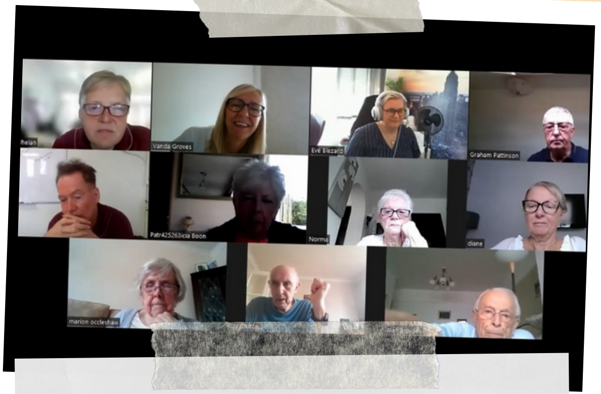
Digital Community Workshop