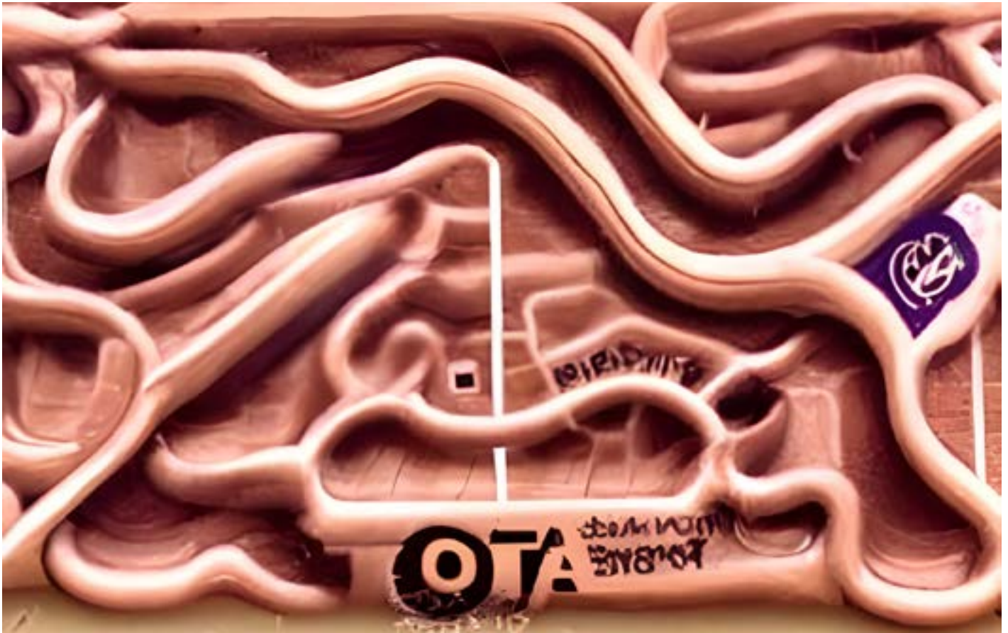
“The Organisation”, as a topographic map, Ordnance Survey