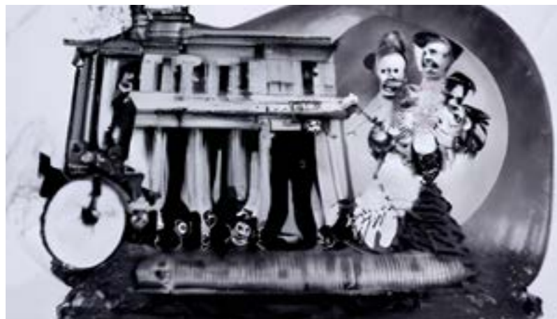
The finance function victorian freakshow photo