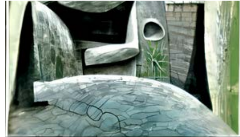
The External Environment drawn on concrete by The New Yorker and Barbara Hepworth