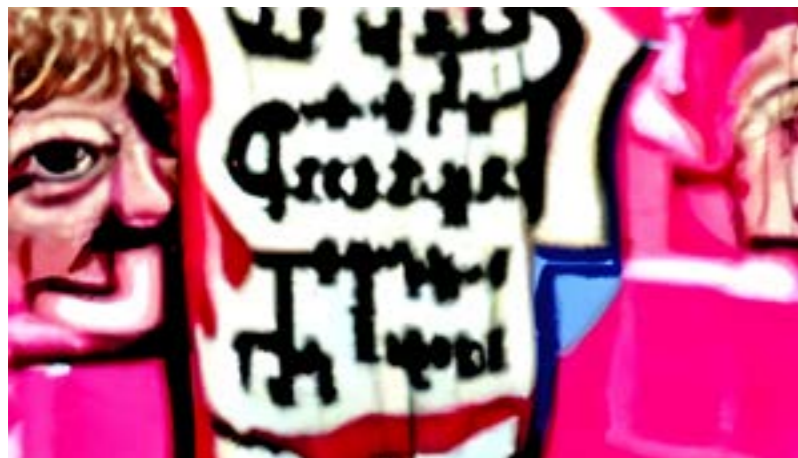
Leadership and Management tapestry by Grayson Perry