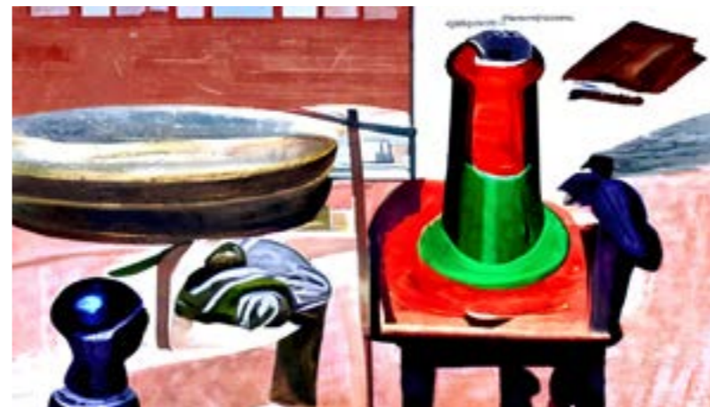
"PESTLE Analysis", vivid, by Evelyn Dunbar (1906-1960)