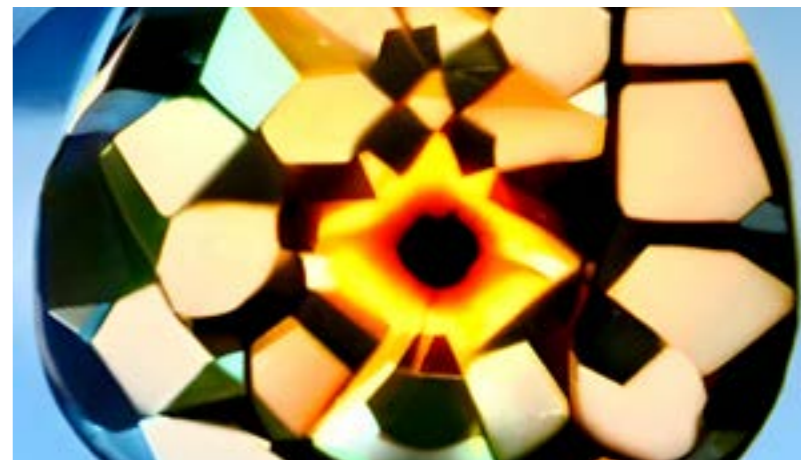
"The Finance Function" shown as a kaleidoscope product design