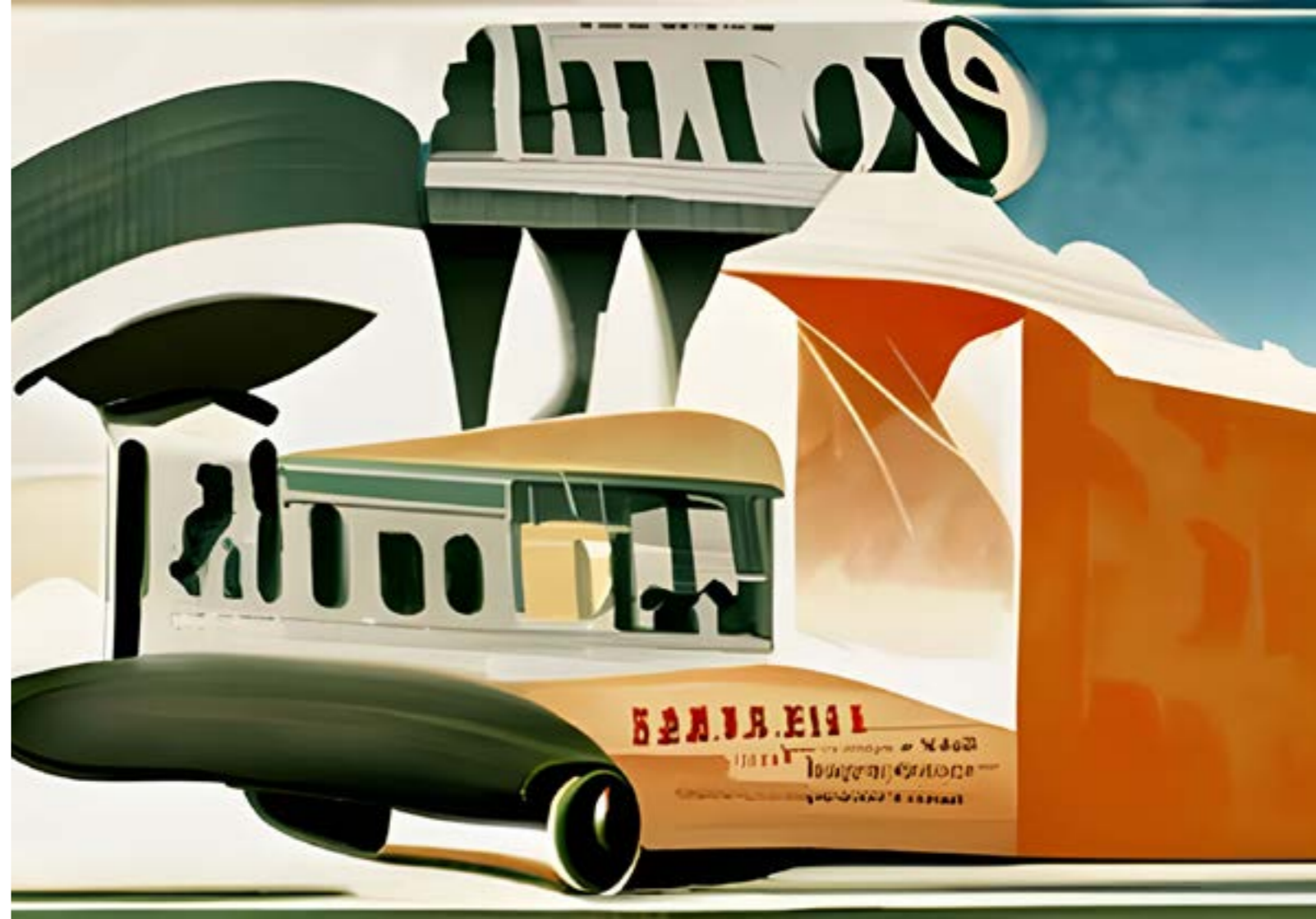
The external business environment as a 1930s style travel poster