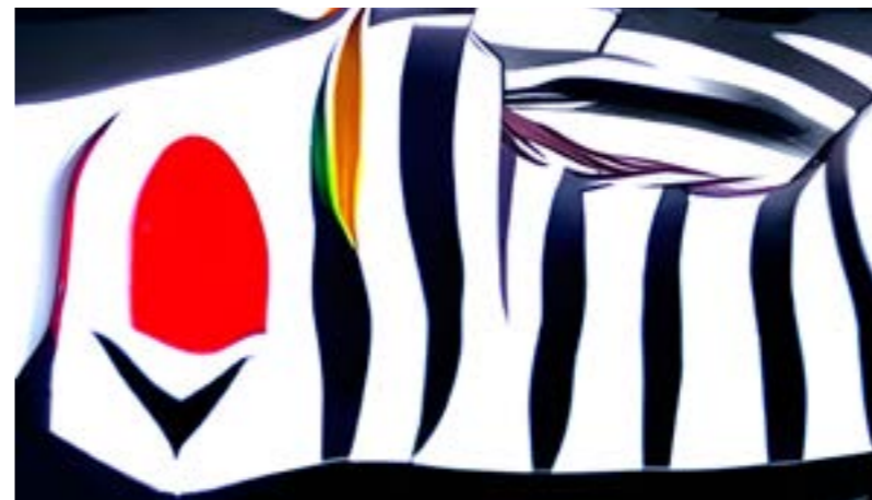
Leadership and management anime style