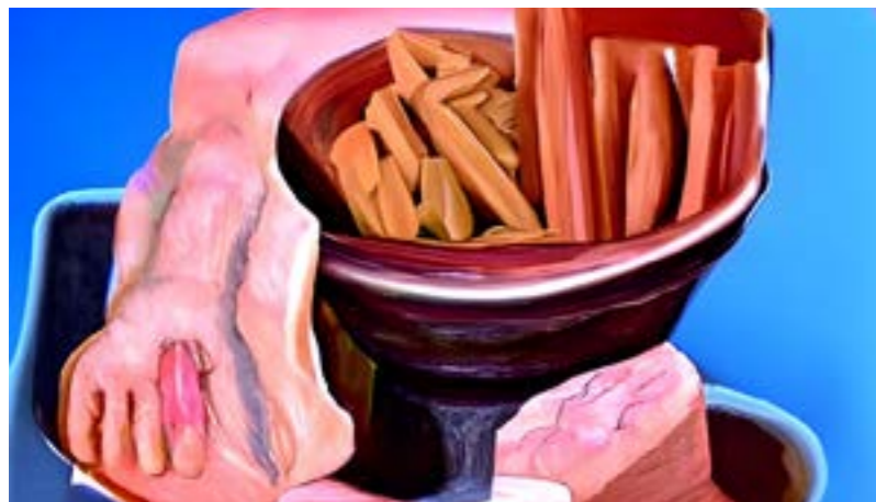
"PESTLE Analysis", oil on canvas, renaissance painting, by David Hockney