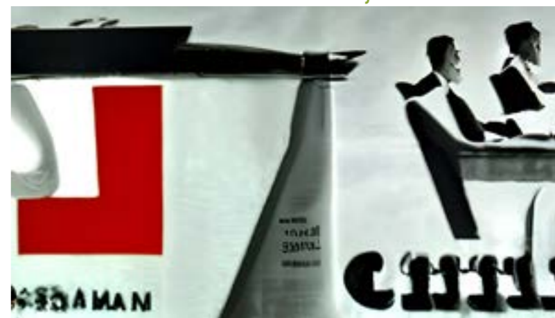
Leadership and management in the style of a 1950s advertisement