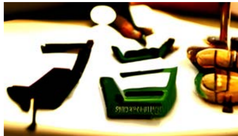
People doing business Sōsaku hanga style