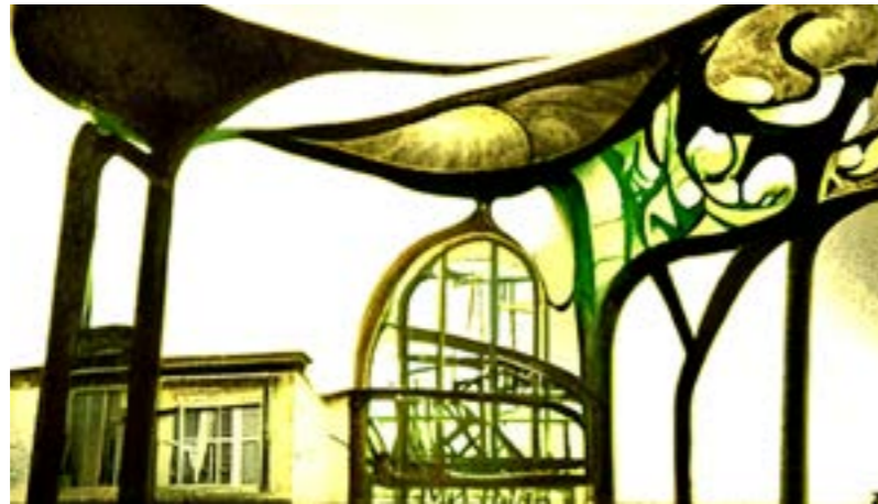
The External Environment as Art Nouveau by Sturtevant