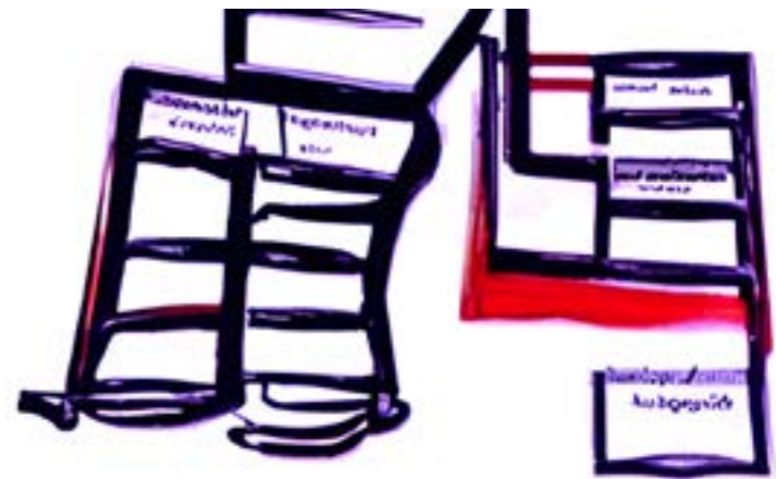
Structure and Functions within Organisations clip art style by Kiki Kogelnik