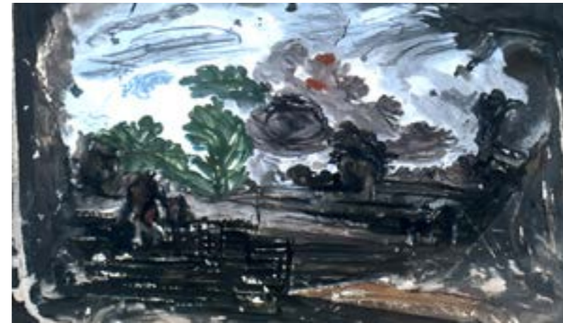
"The External Environment", as a child's drawing, by John Constable