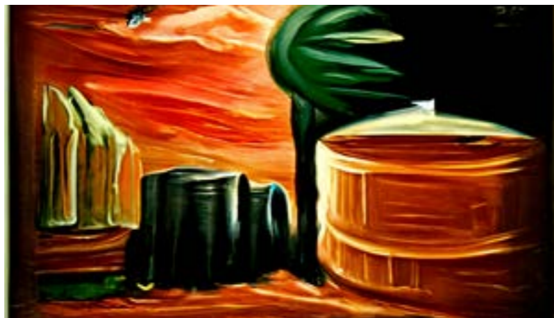
The nature of business oil on canvas in the style of Stuckism