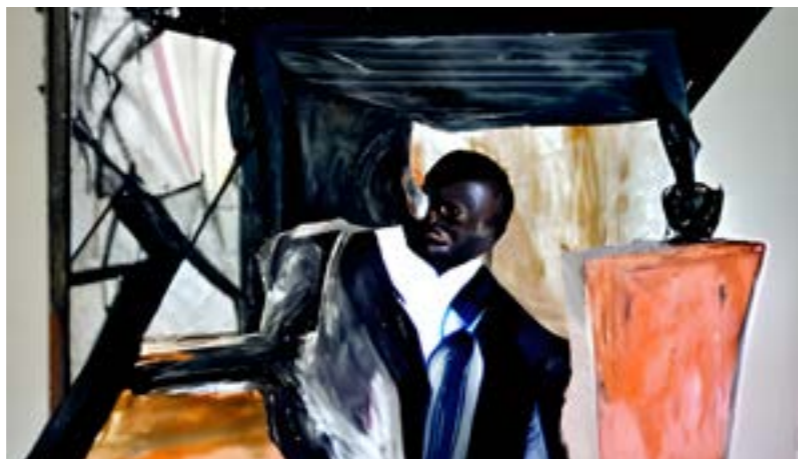
Leadership and management portrait by Lynette Yiadom-Boakye