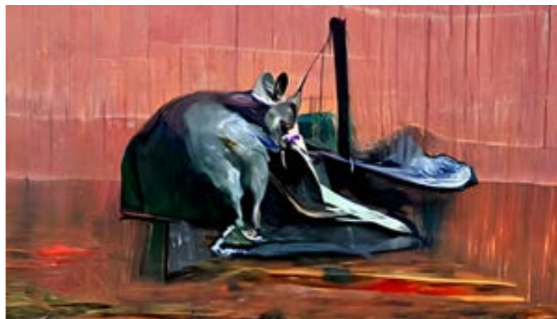
The nature of business in Australian Tonalism style by Francis Bacon