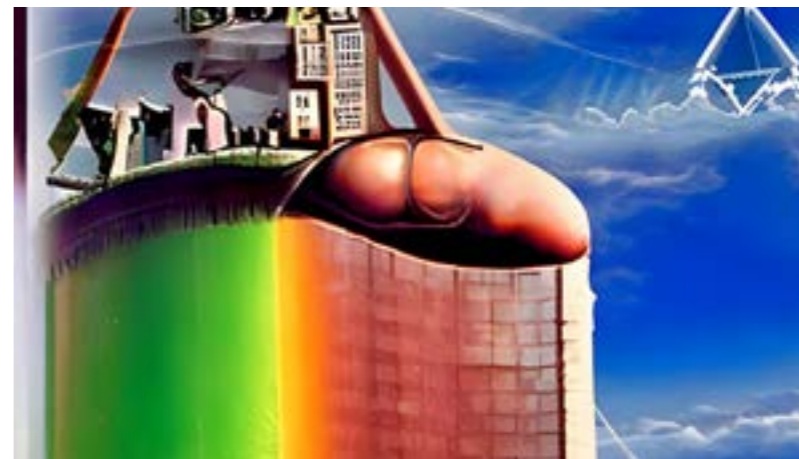
"The Future of Business", Pink Floyd Album Cover Art