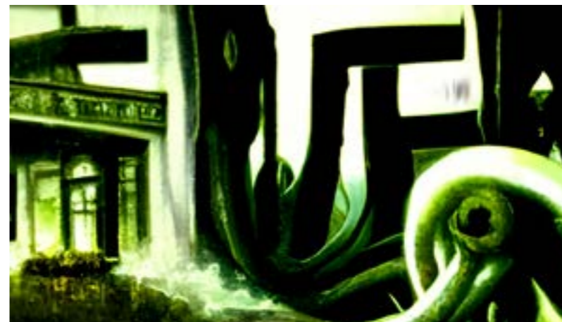
"The Finance Function", Lovecraftian digital illustration