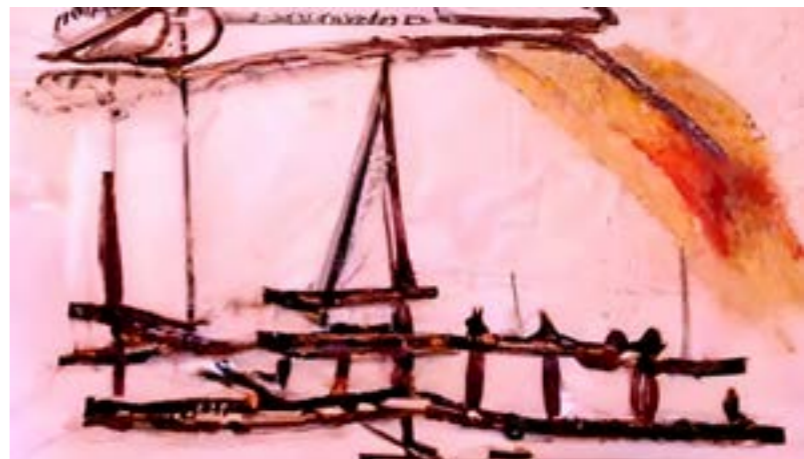
Structures and functions within an organisation by J.M.W. Turner on a happy day