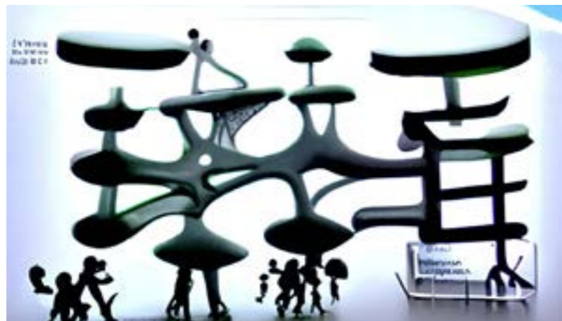
Structures and functions within organisations by Chihyo Aoshima