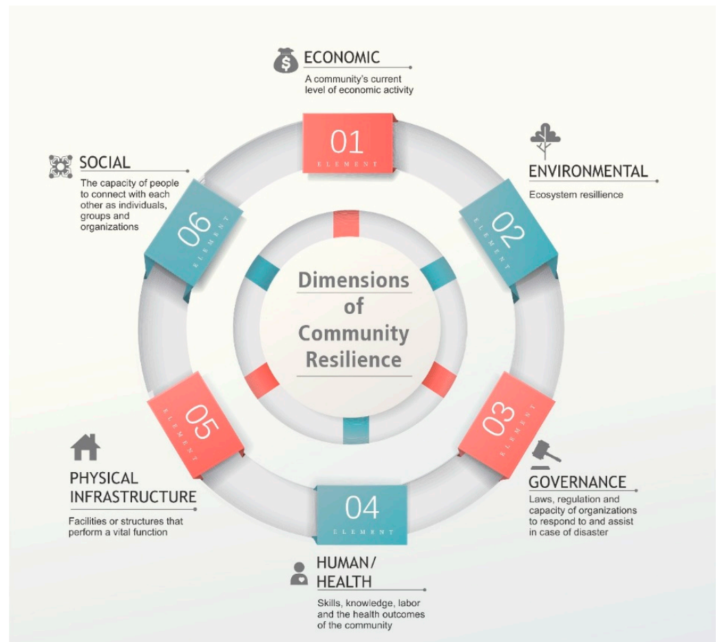
Figure 1. Dimensions of Resilience [22].