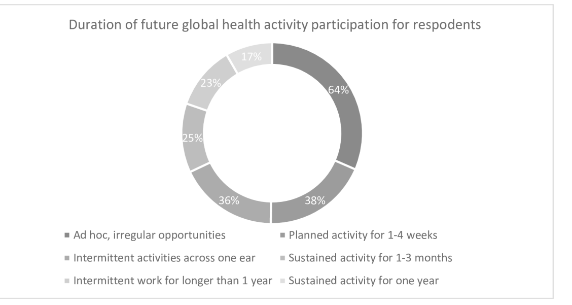
Figure 3 Duration of future global health activity participation selected.

communicate opportunities to enhance staff awareness of the range of global health activities available. The findings of this study show that two forms of organisational communications—internal staff intranet and other internal communications (eg, notes within payslips or emails, magazines or library bulletin boards sources, journals or other publications)—may well be effective ways to raise awareness of the types of opportunities available to staff in global health. Both of these conduits would increase the reach of communications and may lead to a growth in interest in global health opportunities available to staff.