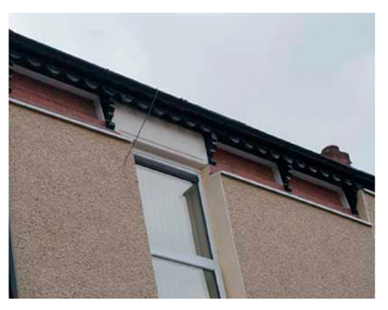
Figure 1: An illustration of a difficult detail in terms of external wall insulation<sup>8</sup>

Whereas some of these issues are certainly down to poor installation, poor design and poor product selection, some of them may have been preventable by carrying out a thorough assessment of the homes. This may have led to different technical approaches being taken, and ultimately a more successful retrofit and healthier homes. We shall discuss this requirement for retrofit assessment in the following section.