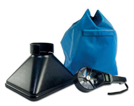
Figure 4: Airflow measurement equipment

Given the entire process of PAS 2035 is intrinsically linked to the improvement of