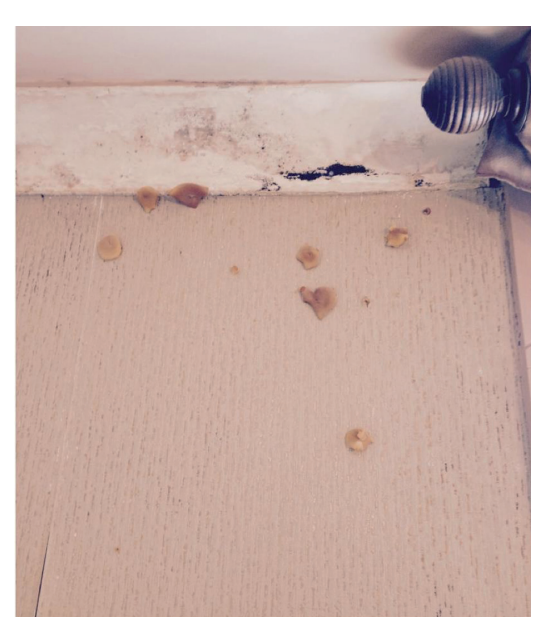
Figure 2: Moisture issues – fungal growth resulting from penetrating moisture<sup>9</sup>