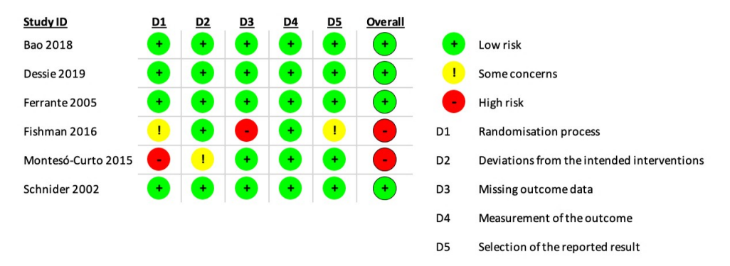
Figure 2. Risk of bias assessment of the studies included.

The risk of bias assessment is displayed in Figure 2. Among the included studies, four were at a low risk of bias, while two were at a high risk. One study was assessed at high risk because of missing outcome data, since the data was not available for all the participants included in the study, and missing outcome data was not adjusted through analysis methods that correct for bias or sensitivity analysis [39]. Moreover, no reason was given for the missing values [39]. The other study was assessed as being at high risk because the baseline differences between groups highlighted possible issues in the randomisation process adopted since the percentage of older individuals was significantly different in the different groups of the study [40].