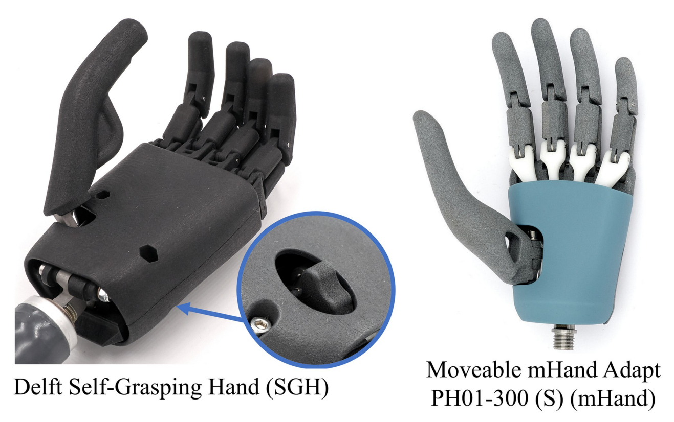
Fig 1. Images of SGH and mHand without any glove equipped. The circular window for the SGH highlights the button users must press to release the grasp. This button is located on the back of the hand. The mHand has no such button to release the grasp. The differences in finger shape are most visible around the tips of the fingers and thumb. Reproduced with permission from Gerwin Smit and Moveable [3].

https://doi.org/10.1371/journal.pone.0300469.g001