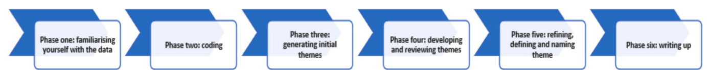
Fig. 1. Braun and Clarke's (2022) process of reflexive thematic analysis.