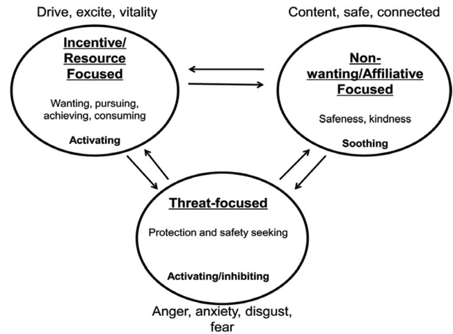
FIGURE 1 The three-system model of emotion. Reproduced with permission from Gilbert (2009)

CFT and CMT aim to bring balance to three emotional systems: the threat , drive and soothing systems. The three-systems model (See