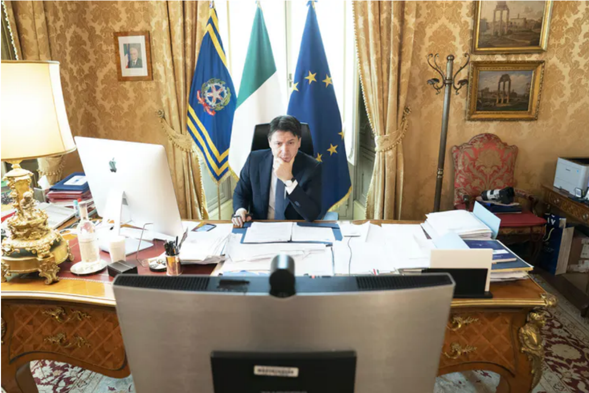
Conte dials in to a meeting of European leaders.

Yet Conte's real problems could be just about to begin. The economic impact of the continued lockdown is on a scale that has no precedents outside wartime. The projected figures for 2020 of the ministry of the economy, largely in line with those of the IMF, forecast big trouble ahead. GDP is projected to contract by 8% (against a pre-COVID predicted rise of 0.6%), the public deficit to rise from 2.2% to 10.4%, public debt to GDP to rise to an astronomical 155.7% (from a pre-COVID forecast of 135.2%) and the rate of unemployment to 11.6%. Forecasters estimate that 10 million Italians, a fifth of the total number of adults, will be thrown into poverty, unable to meet essential expenditure on food, medicines and a roof over their heads.