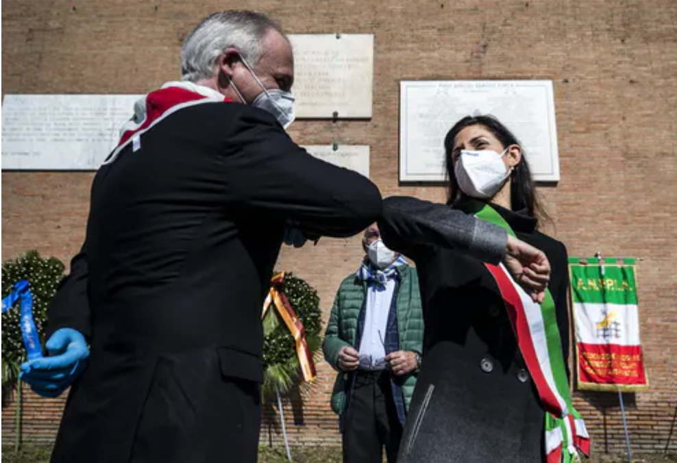
Local officials greet each other in Rome with an elbow bump.