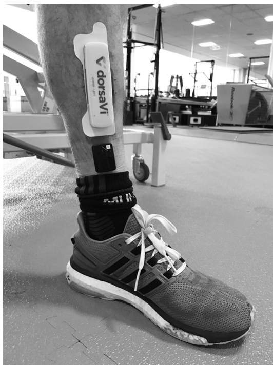
Fig. 1. Photograph of inertial measurement unit placement on left tibia.

period. This was repeated twice further, giving three repetitions in total. During the rest period following the third repetition, the treadmill speed was increased to 18kmph and a further three trials were completed with corresponding 60 s rest periods, after which data collection was concluded. Participants completed their usual training routine after the first testing session. The same protocol was repeated approximately 24 h following the first session to eliminate training exposure effects.