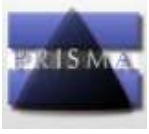
Figure 1. PRISMA Flow Diagram