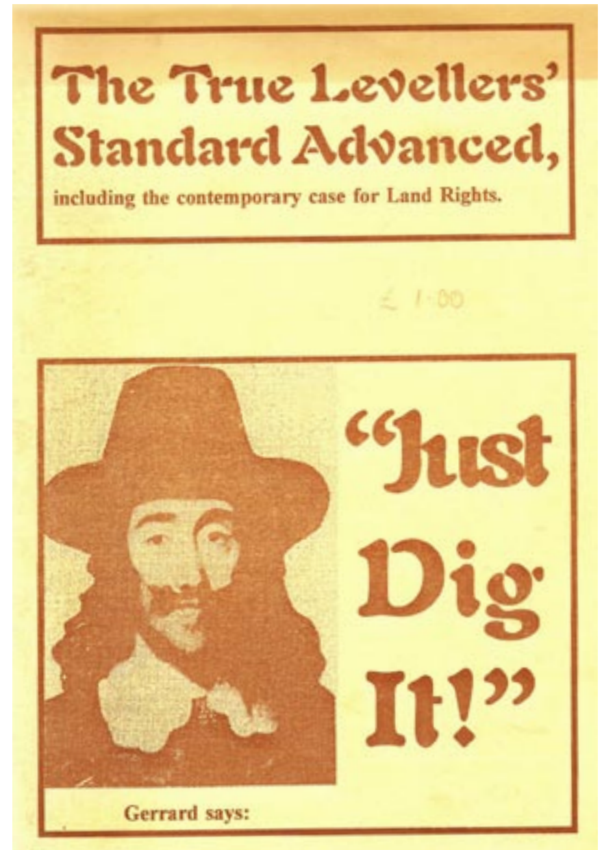
Figure 2. The horticultural counter-culture through its radical pamphlets: ‘Just dig it!’ introduces the writings of the seventeenth century Diggers to twentieth century youth

These three versions of the plot – land, history, politics – are interwoven. The garden can become the source of political identity or power, including in cases which speak more readily to the majority of people who are not or were not as privileged. The so-called ‘Votingham’ housing estates of the nineteenth century, for instance, were developed to exploit the link between freehold property ownership and the franchise; it is not going too far to argue