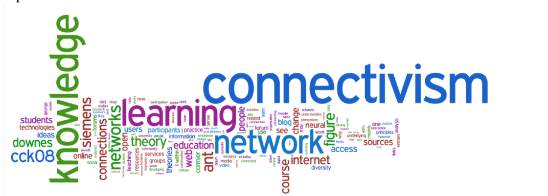
Figure 1 - Wordle of text of this article http://www.wordle.net/gallery/wrdl/752365/Connectivism_article

Genres of media tools such as blogs and wikis are freely available as online services, enabling individuals and groups to share and publish media, connected by links and ‘feeds’ that allow us to monitor sources that interest us rather than rely solely on Internet searches. If we watch out