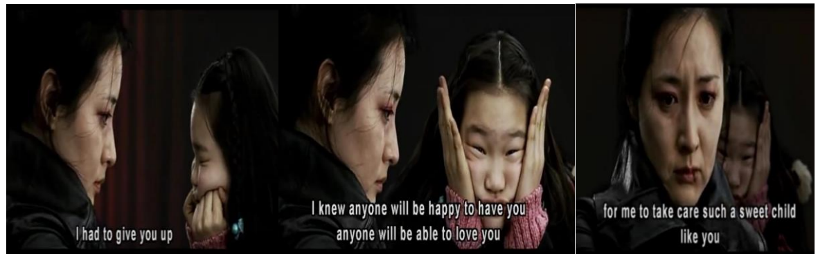
Figure 45 Lady Vengeance

In Lady Vengeance , Geum-ja attempts to converse with her biological daughter, but the language barrier means that a narrator is required to mediate.