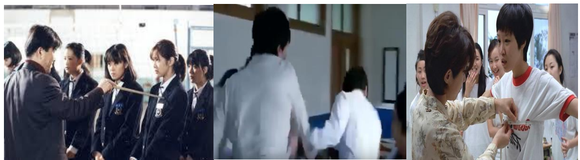
Figure 27 Whispering Corridors, Death Bell , and Memento Mori Mr. Oh, the strict disciplinarian, admonishes his students in Whispering Corridors (left). Kang Hyun is physically assaulted by Mr. Lee in Death Bell (centre). In Memento Mori , students are also subjected to psychological humiliation, seen here on physical examination day (right).