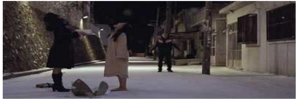
Figure 46 Lady Vengeance

In Lady Vengeance , Geum-ja attempts to converse with her biological daughter, but the language barrier means that a narrator is required to mediate.