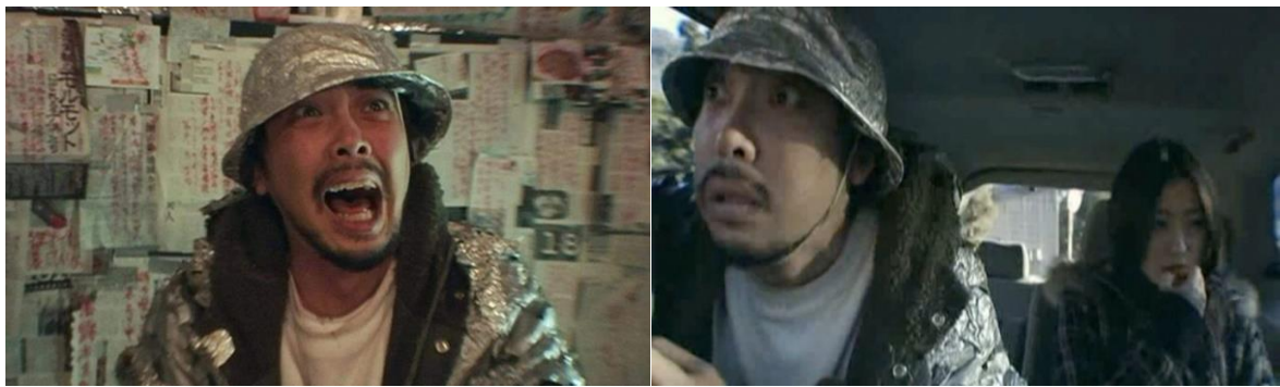
Figure 18 Noroi: The Curse Noroi's conspiracy theorist, Mr. Hori.