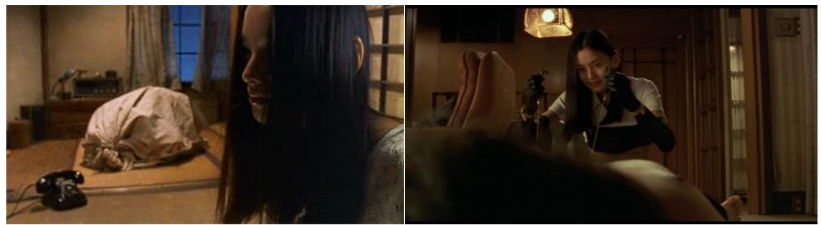
Figure 39 Audition

In Audition , Asami waits for Aoyami's call (left). In the backgroud, a twitching burlap sack contains one of her mutilated victims. On the right, Asami begins to dismember Aoyami, believing him to have broken his promise to commit to her unconditionally.