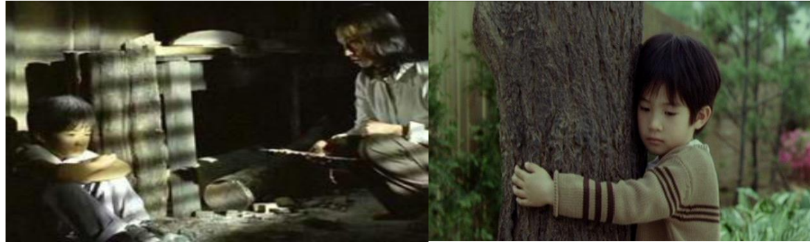
Figure 34 Acacia

The ghost of the dead mother visits Soo-mi in the night. The camera captures Soo-mi's look of horror in a shot from between and behind the mother's legs (left). A trickle of blood runs down the mother's legs (right), before Soo-mi awakens to discover that she is beginning her menstrual cycle.