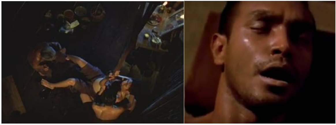
Figure 44 Nang Nak

Dumplings : Mei obtains the foeti for her rejuvinating dumplings from an abortion clinic in Shenzen on the mainland (left). When she carries the illicit ingredients through customs (the geopolitical borders of China and Hong Kong) the camera again provides a truncated close-up shot of Mei's hand (centre). The alternative to procuring the foeti from across the border is for Mei to perform black market abortions (right).