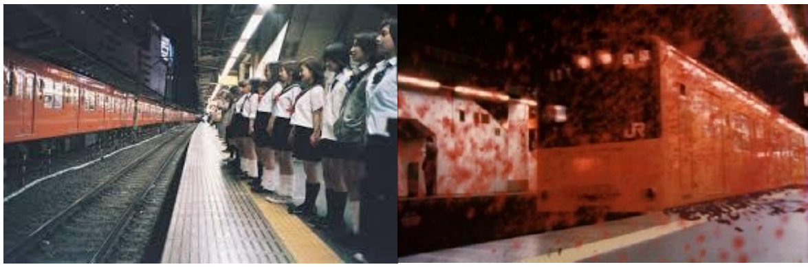
Figure 21 Suicide Club

Fifty-four school children hold hands at a Tokyo station platform before jumping in front of the oncoming train. The scene is the catalyst for a wave of suicides sweeping the city in Suicide Club .