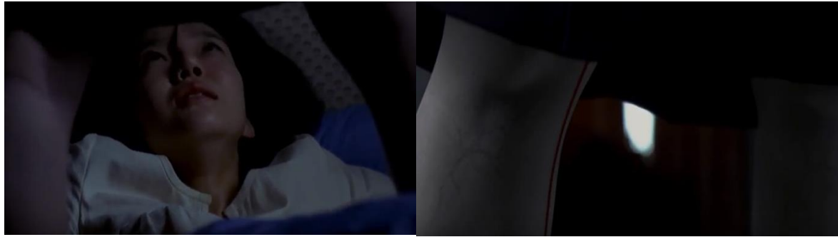
Figure 33 A Tale of Two Sisters

The ghost of the dead mother visits Soo-mi in the night. The camera captures Soo-mi's look of horror in a shot from between and behind the mother's legs (left). A trickle of blood runs down the mother's legs (right), before Soo-mi awakens to discover that she is beginning her menstrual cycle.