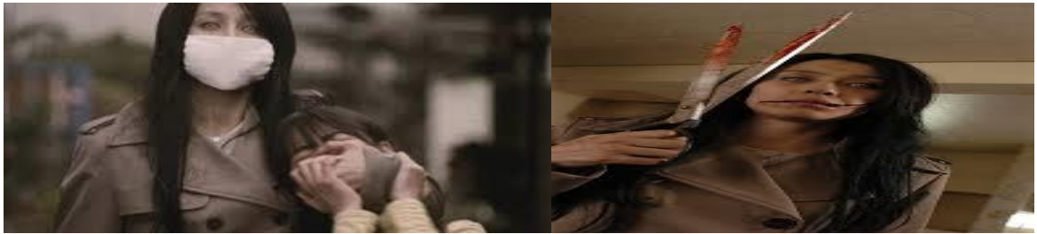
Figure 10 Carved: The Slit-Mouthed Woman

"Am I Pretty?": The slit-mouthed woman of Carved abducts children who do not give the correct response (left); she is codified in both the style of the Yureii and, with the scissors as her chosen weapon of torture and mutilation (right), as the deadly femme castratrice .