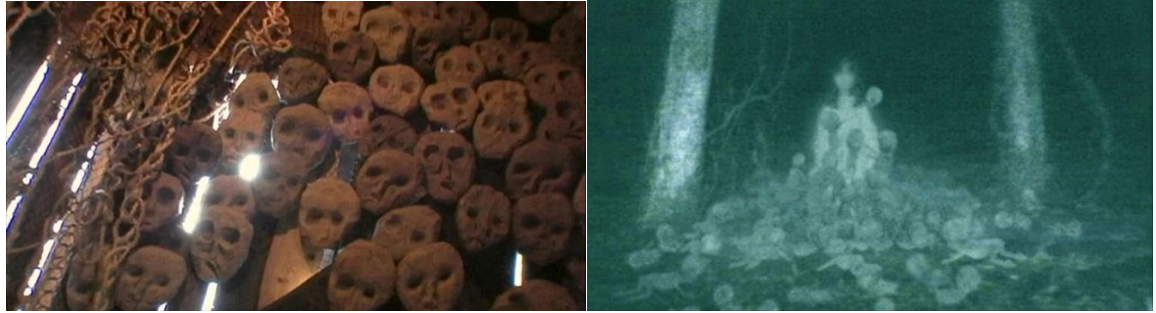
Figure 20 Noroi: The Curse Kana's drawing is later shown to correspond to Kagutaba iconography displayed across the village (left). As part of the ritual to summon the demon, the kidnapped Kana is covered in foeti (right).

The psychic children are observed from behind the camera (left). Kana's ESP is ahead of the show's tests (centre). Kana, the most prescient of the contestants, is interviewed about the "incorrect" prediction (right).