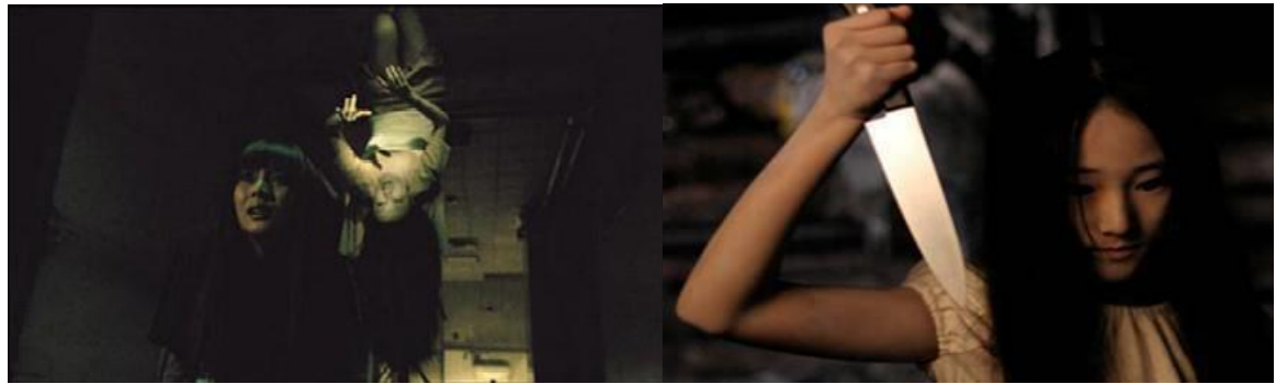
Figure 14 One Missed Call

Kenji realises a moment too late that the call foretelling his death is about to be executed (left). Yumi witnesses her friend being dragged into the empty elevator shaft (centre); seconds later, the door of the shaft opens, and life carries on as normal around her (right).