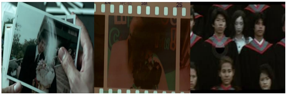
Figure 11 Shutter

In Shutter , Natre's curse manifests as facial distortion on developed pictures (left), a mark on the negative film (centre), and the imposition of her image in other photographs (right). When she appears in Tun's reality, she is able to occupy the same space as her victim, as demonstrated in the final scene (below).