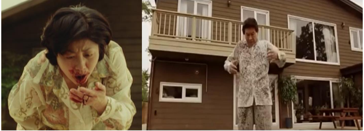
Figure 35 Acacia

After her adopted son has set the garden shed alight in Acacia , Mi-sook's primary concern is the totemic fan given to her by her mother (left). Jin-seong feels a stronger connection to his dead biological mother, whom he believes has returned to nature in the form of the acaica tree in the garden (right).