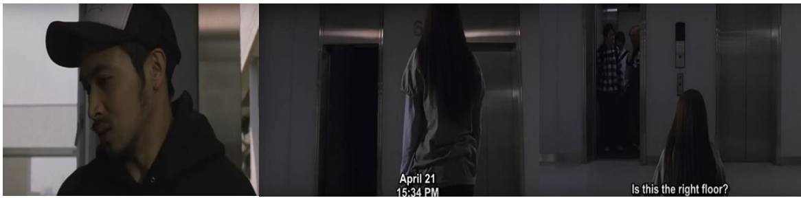
Figure 13 One Missed Call

Kenji realises a moment too late that the call foretelling his death is about to be executed (left). Yumi witnesses her friend being dragged into the empty elevator shaft (centre); seconds later, the door of the shaft opens, and life carries on as normal around her (right).