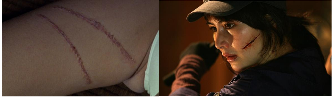
Figure 47 Audition and Dream Home

Any reunification between mother and daughter is only fleeting in Lady Vengeance , for Jenny must return to her adoptive parents in Australia. The narrator tells us that Geum-ja received no redemption from her revenge on Mr. Baek.