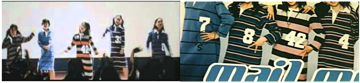
Figure 22 Suicide Club

Fifty-four school children hold hands at a Tokyo station platform before jumping in front of the oncoming train. The scene is the catalyst for a wave of suicides sweeping the city in Suicide Club .