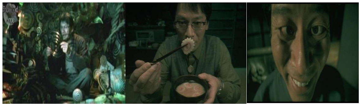
Figure 8 Uzumaki

In Uzumaki , Mr. Saito goes from collecting kitsch objects with spiralled imagery to a fasicnation with spiral-shaped food to the abstract concept of the spiral, which, he claims, one brings out of oneself.