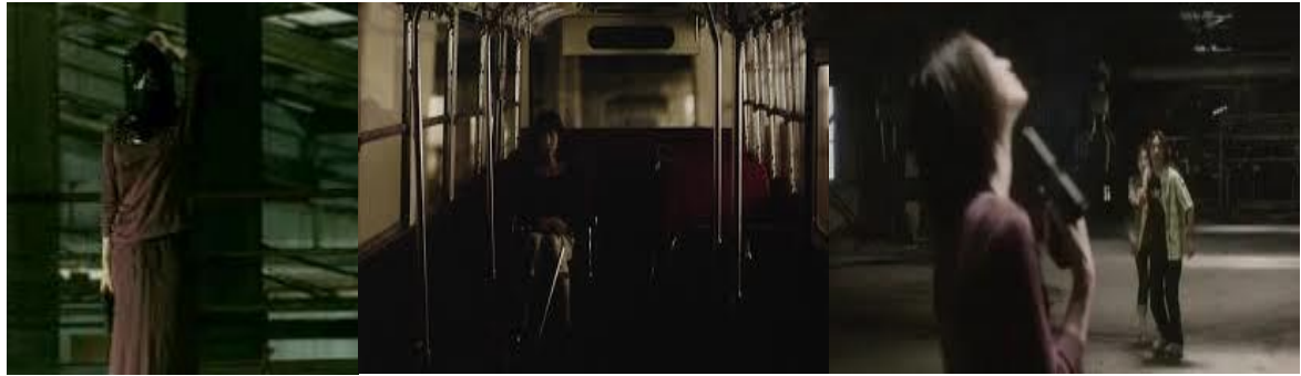
Figure 17 Pulse Ghosts, isolation, and suicide are three of the key themes explored in Pulse .

Inside the forbidden rooms, the ghostly imprint of dissolved subjectivity manifests as a black stain on the wall (right), moments after a flicker of former subjective image can be glimpsed (left).