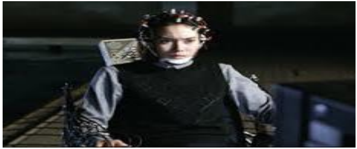
Figure 4 Ringu 2

Mai, assuming the role of maternal protector for Yoichi, consents to undergo psychic experiment in an attempt to rid her ward from Sadako's curse in Ringu 2 . This experiment goes awry and instead unleashes Sadako in physical form.