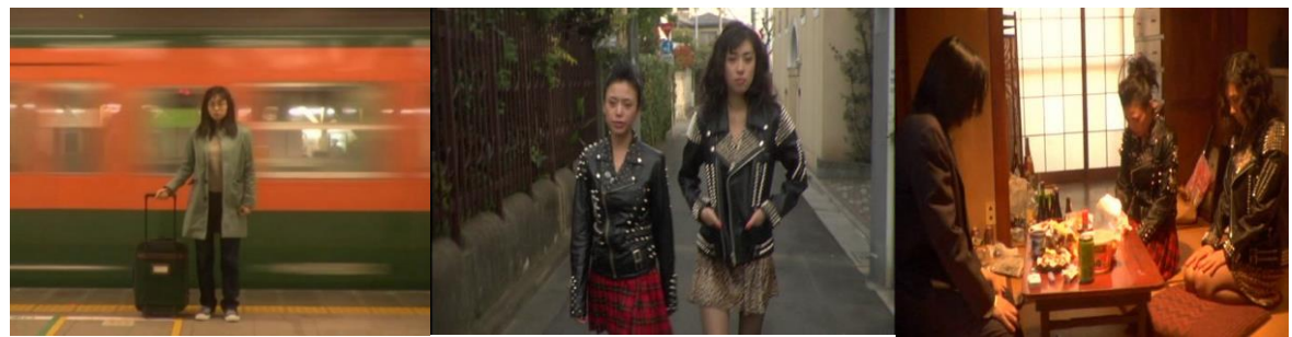
Figure 23 Noriko's Dinner Table

Teenage J-pop band Dessert (frequently mispelled) play an integral part in the subliminal spreading of suicidal tendencies. Mitsuko discovers that the hidden message in the group's iconography, which leads her to the location of the club's secret headquarters.