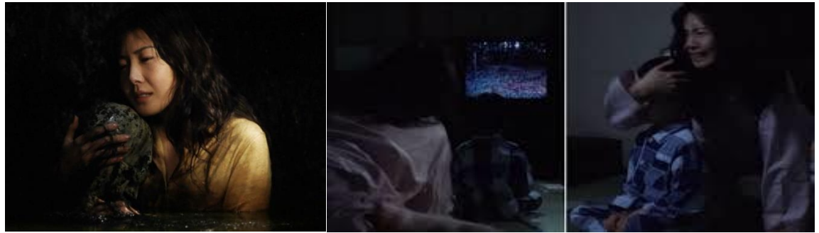
Figure 2 Ringu

In Ringu , Reiko discovers blurred facial features on developed photographs of those who have watched the cursed video tape (left). Later, when she watches the tape, her own photograph develops blurred (right).