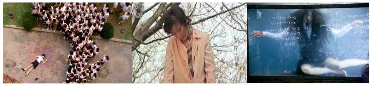
Figure 28 Memento Mori , Whispering Corridors , and Death Bell Death Becomes Them: Hyo-shin commits suicide in Memento Mori as a result of social ostracism (left), as does So-hee in Wishing Stairs . Mrs. Fox's death is framed as a suicide in Whispering Corridors (centre). In Death Bell , failure to provide the correct answer within the alloted time frame results in a student's death (right).