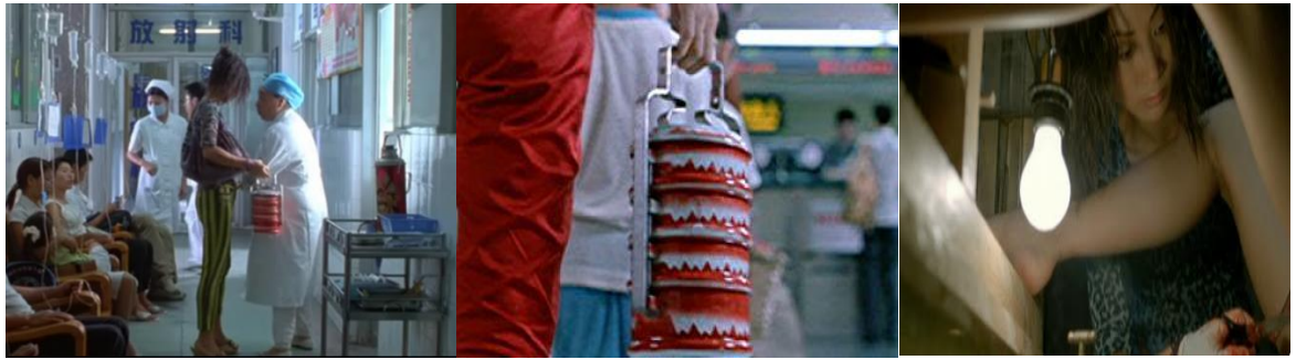
Figure 43 Dumplings

Nang Nak : Ghost Nak appears from above as the villagers perform an incantation to ward off her spirit (left). The effective purging ritual involves the exhuming of Nak's corporeal remains (right). The corpse, in abjection, is the ultimate of all borders: death infecting life.