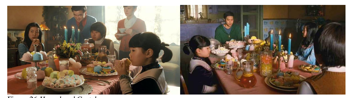
Figure 26 Hansel and Gretel The uncanniness continues the following morning at breakfast, where only an array of sweet treats are served. The children look to Eun-soo, copying his every action.