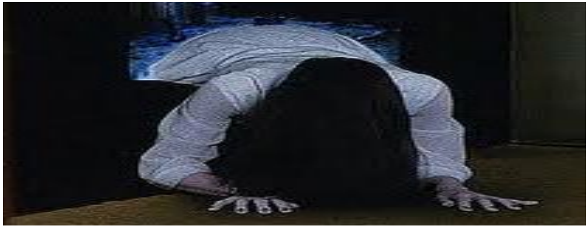
Figure 3 Ringu Sadako emerges through the borders of the television screen to claim her victim.

Reiko exhumes Sadako's body from the well (left). Yoichi watches the cursed tape (centre). Reiko realises in horror that she must find a solution to save Yoichi (right). The scenes involving Reiko cradling a cursed child may mirror image one another, but the resurrection of Sadako does not lift the curse. Instead, Reiko learns that the correct purging ritual (or deferment ritual) is to copy the tape for another to watch.