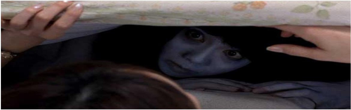
Figure 36 Ju-On: The Grudge

In Ju-On, the mother and child are linked semiotically through their status as abject spirits, as well as their connection to the natural and animalistic (specifically, to the black cats). They are frequently signified in the film by a pale, blue hue that marks them as Other (above and below).