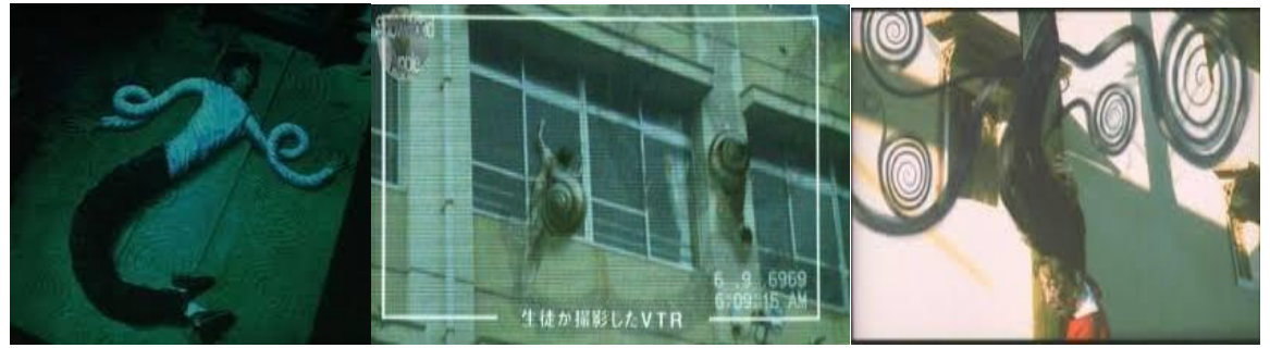
Figure 9 Uzuamki

In Uzumaki , Mr. Saito goes from collecting kitsch objects with spiralled imagery to a fasicnation with spiral-shaped food to the abstract concept of the spiral, which, he claims, one brings out of oneself.