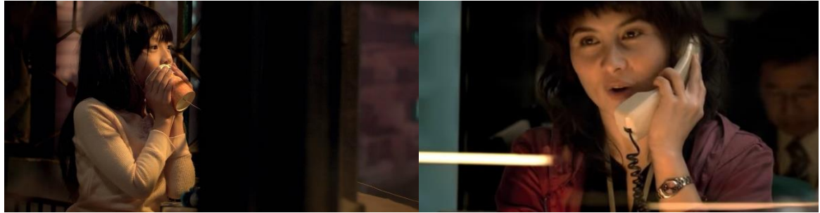
Figure 40 Dream Home

In Audition , Asami waits for Aoyami's call (left). In the backgroud, a twitching burlap sack contains one of her mutilated victims. On the right, Asami begins to dismember Aoyami, believing him to have broken his promise to commit to her unconditionally.