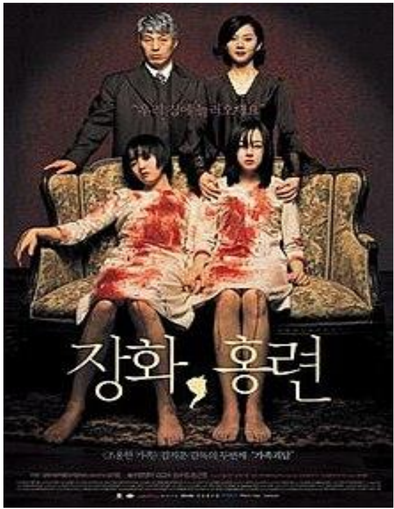
Figure 32 A Tale of Two Sisters Promotional poster for A Tale of Two Sisters .