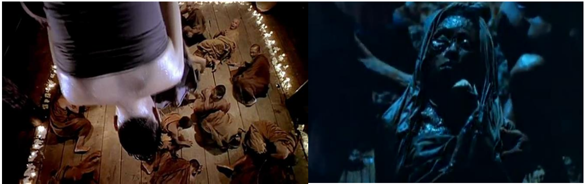
Figure 42 Nang Nak

Nang Nak : Ghost Nak appears from above as the villagers perform an incantation to ward off her spirit (left). The effective purging ritual involves the exhuming of Nak's corporeal remains (right). The corpse, in abjection, is the ultimate of all borders: death infecting life.