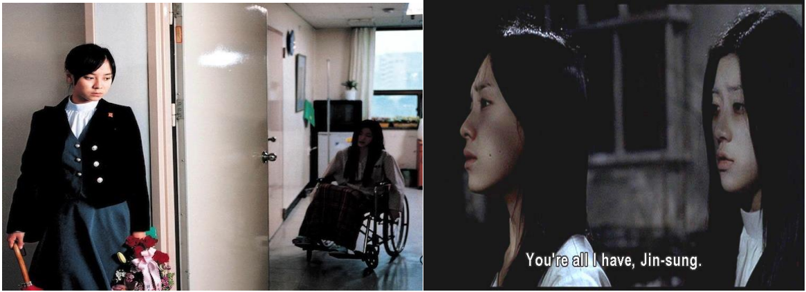
Figure 29 Wishing Stairs

Sonyeo Sensibilities 1: In Wishing Stairs , So-hee and Jin-sung are best friends and share a close, intimate relationship defined as sonyeo . However, the competitive nature of the ballet school drives a wedge between them. So-hee is left hospitalised after a fight between the two girls, costing her a place in a prestigious Russian ballet school (left). So-hee longs to be with Jin-sung, even in death (right).