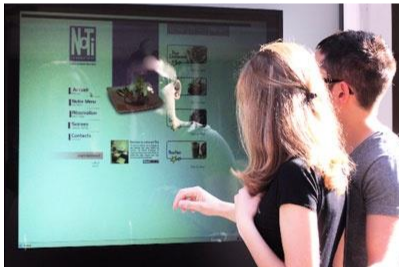
Figure 3: Interactive shop window.

sustainable high street and supply chain, Popupshop proposed an innovative “pop-up shop” retail model. This model reverses the usual trend of high street brands moving from real to the virtual (“bricks and clicks” model) and instead proposes a physical, yet temporary, presence for pure-play virtual brands. The management of this supply chain becomes a key element for success. Initially the space managers must create the demand and residents are invited to co-create their high street via a digital shopfront. QR codes in empty shop windows lead to a survey asking “what would you like to see here?”, or an interactive shop window (Fig. 3) encouraging consumers to share their suggestions. Integrating the survey with social media accounts increases social reach, and in turn the volume of input into the co-creation of a particular street. Each popup cluster in each high street delivers a unique blend of goods and brands. Supply then meets a customised, current and socially specified demand; a consumer-driven delivery strategy for innovation and co-creation (Russo-Spena and Mele, 2012) drawing on the ‘lead user’ and their ability to “anticipate the requirements of the broader market” (Von Hippel, 2009), in this case the requirements are expressions that the local community has of its high street.