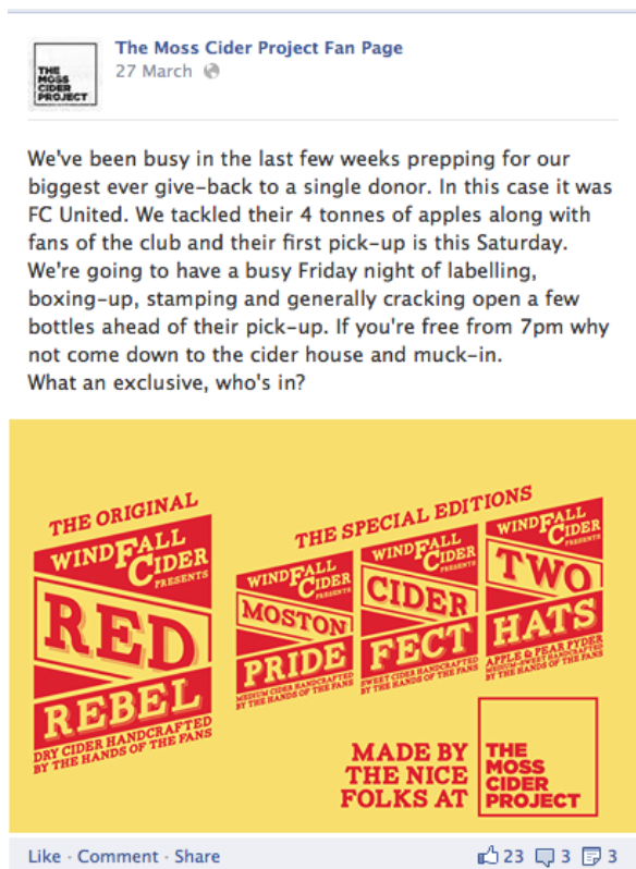
Figure 2: An example of bringing the 'social' to the supply chain

learn how to cider press and there is an interest in developing a local skill base as they encourage participation in the newly established orchard and green spaces metres away from one of the major transport arteries into Manchester. A genuine social supply chain that relies on human action as a key component of the supply chain process 'to create unique and individualized sources of customer value, leading to customer satisfaction' (Mentzer et al 2001:7)