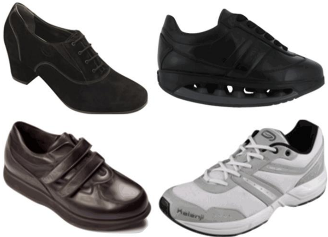
Figure 1: The shoes (Top left: Scholl Flon, Top right: Scholl Starlit, Bottom left: Duna Diabetic Rocker, Bottom right: Kalenji Ekiden 50)