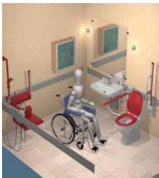
Figure 4 An Avatar is used to test a 3D representation of a bathroom

Whether the digital mock-up is tested by a wheelchair user as seen in the futuristic scenario or by an Avatar as presented in figure 4, this case study illustrates the potential that Immersive Virtual Reality can have on visualisation of architectural design and the possibility of the digital model to replace the physical one which has been used for a very long time to enable both the architect as well as the client to visualise the building and its visual effect prior to construction [20] [21].