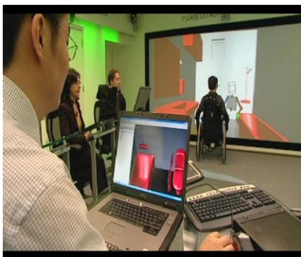
Figure 2 The wheelchair user is testing the bathroom's layout using the digital mock up during the meeting

Immersive Virtual Reality is used here to produce the digital mock up in an attempt to replace the physical one in this scenario, so the meeting does not end here, but it carries on where changes can be applied by the various stakeholders as they discuss their viewpoints. Once all changes are made, the wheelchair user starts testing the bathroom's model for the second time. Once an acceptable solution for a new design layout is agreed, the meeting ends with a definitive validation of the design, and the participants can then return to their everyday work without the need for further meetings to be organised and for physical mock-ups to be modified.